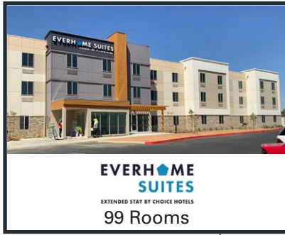
EVERHOME SUITES EXTENDED STAY BY CHOICE HOTELS 99 Rooms