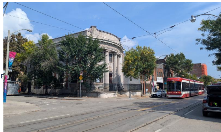
Queen Street East