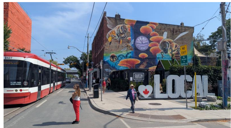
Saulter Street – Queen Garden Cafe