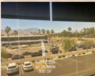
SUITE 205 930 SF | Second Floor Abundant Natural Light & Views