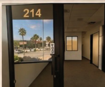
SUITE 214 816 SF | Second Floor Bright Interior & Efficient Layout