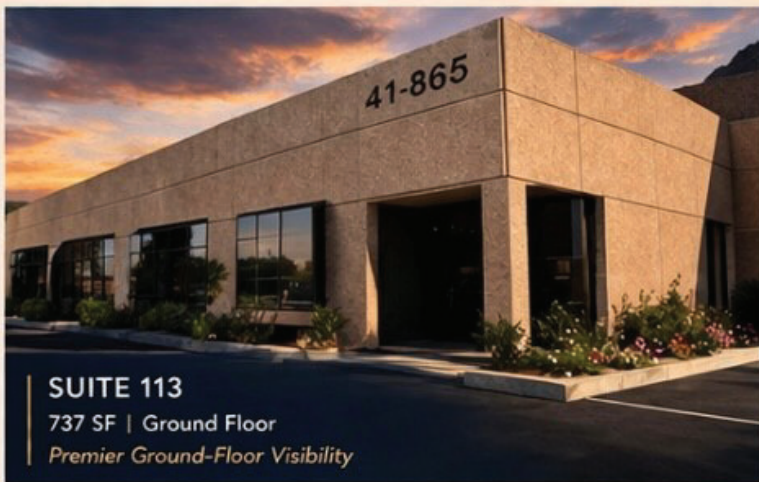
SUITE 113 737 SF | Ground Floor Premier Ground-Floor Visibility