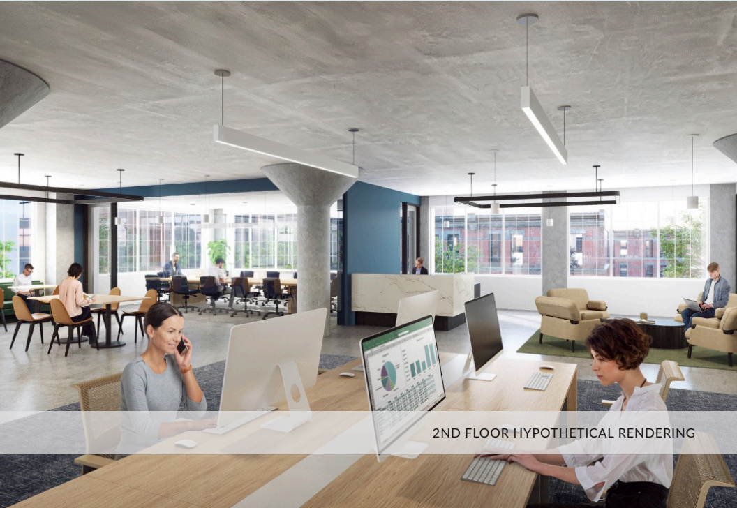
2ND FLOOR HYPOTHETICAL RENDERING