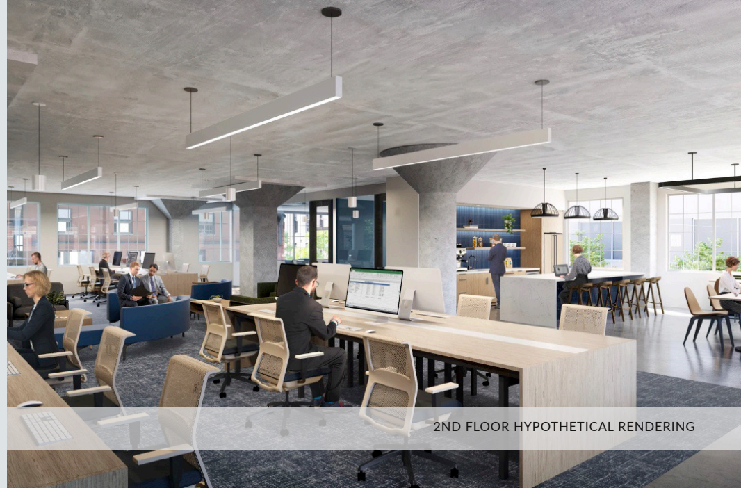
2ND FLOOR HYPOTHETICAL RENDERING