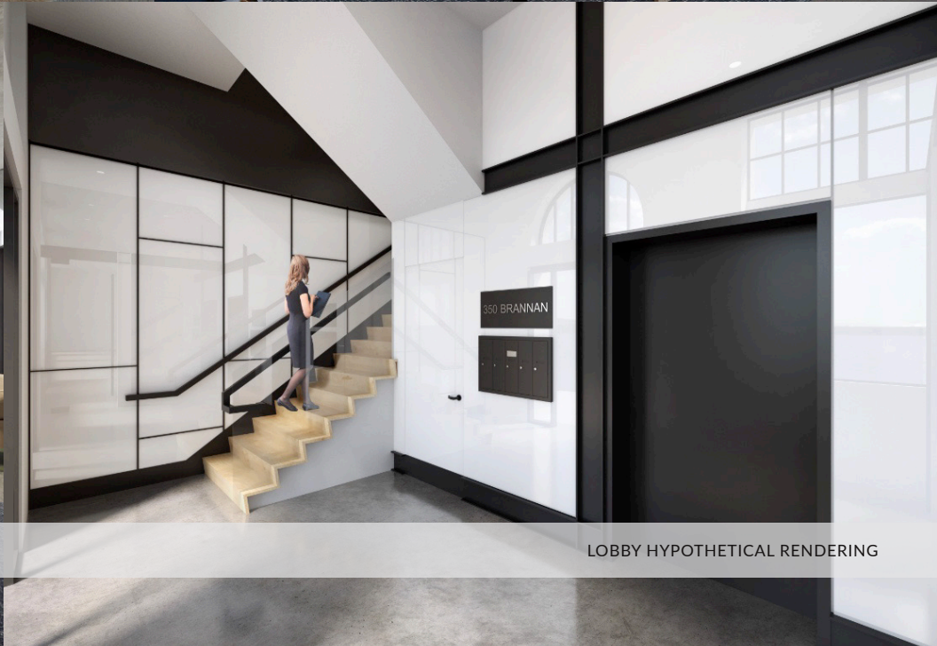
LOBBY HYPOTHETICAL RENDERING