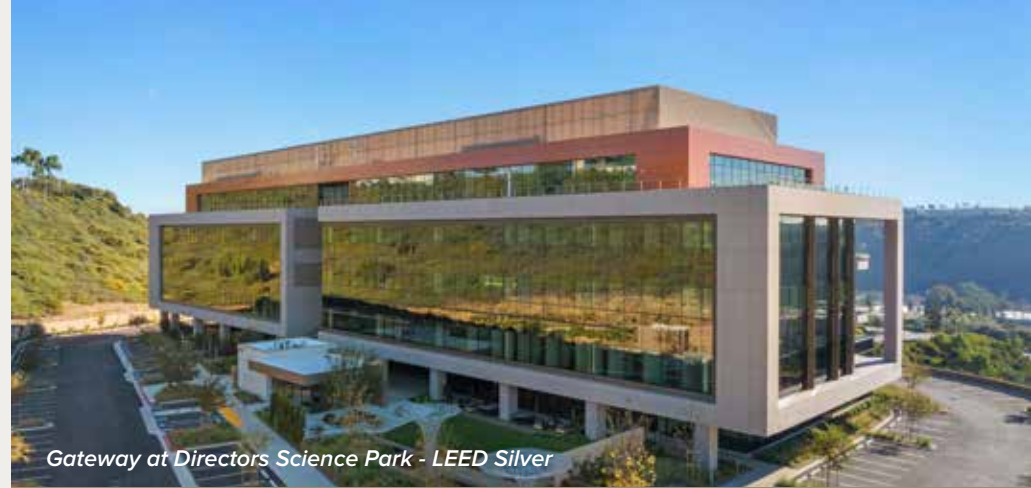
Gateway at Directors Science Park - LEED Silver

±11 million sq. ft. of existing lab space nationwide across ±140 properties in three key life science markets. Plus, ±37 million sq. ft. of outpatient medical space and ±10,000 CCRC units.