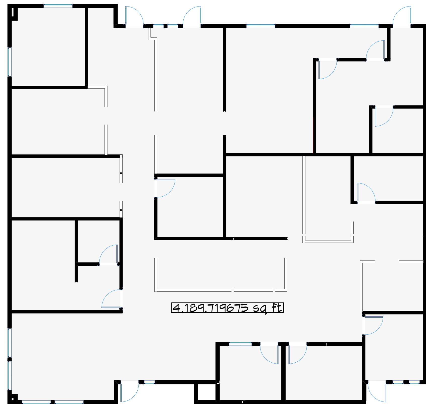
F/P Elsie's Office Floor Plan SCALE: 1/8" = 1'-0"