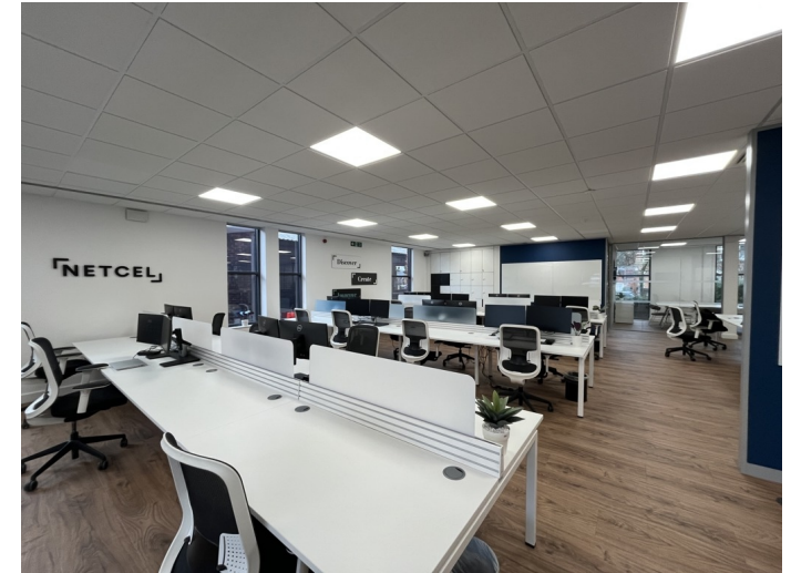
Open Plan Office