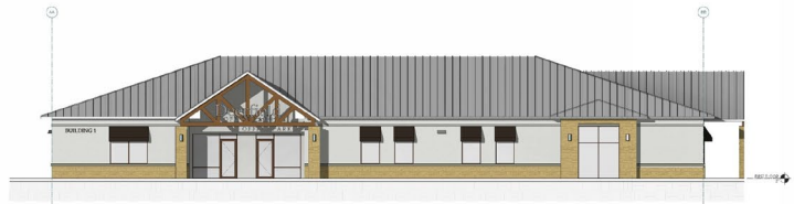
④ SOUTH ELEVATION - COLOR 1/8" = 1'-0"