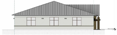
② WEST ELEVATION - COLOR 1/8" = 1'-0"