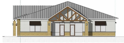
① EAST ELEVATION - COLOR 1/8" = 1'-0"