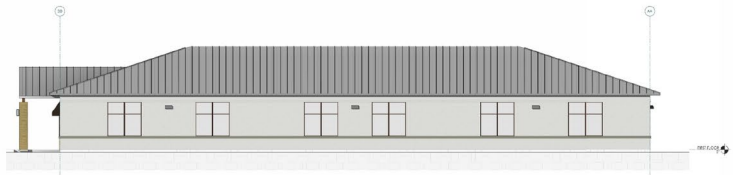
③ NORTH ELEVATION - COLOR 1/8" = 1'-0"