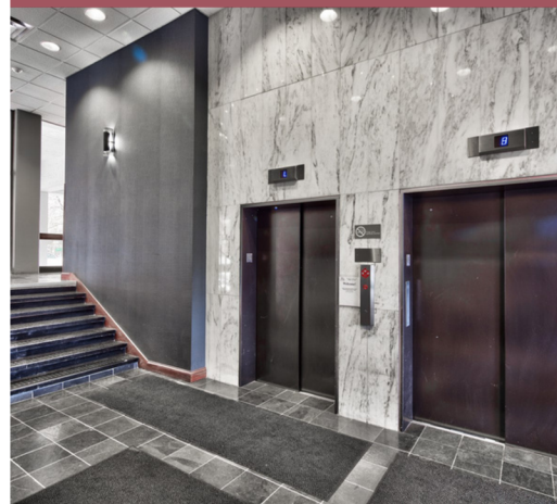
MARBLE LINED ELEVATOR