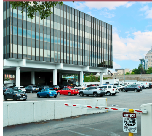
SECURE ON-SITE PARKING LOT