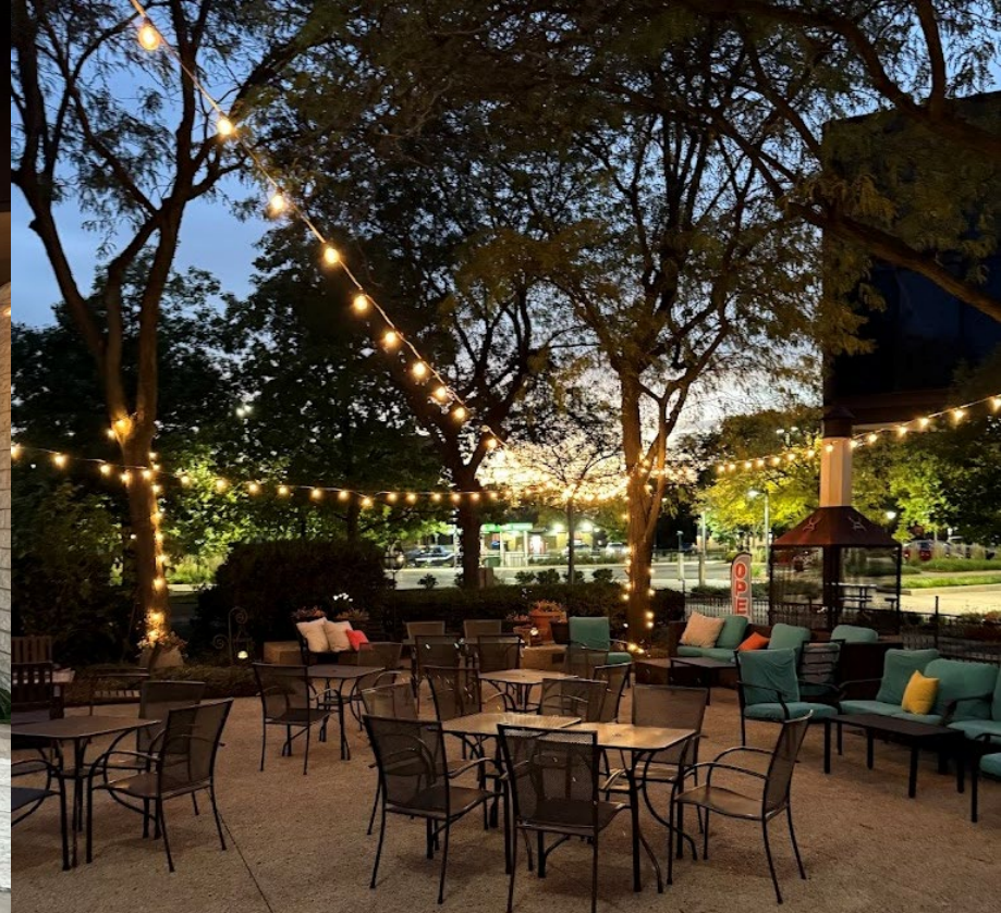
(Optional Additional) Patio Area