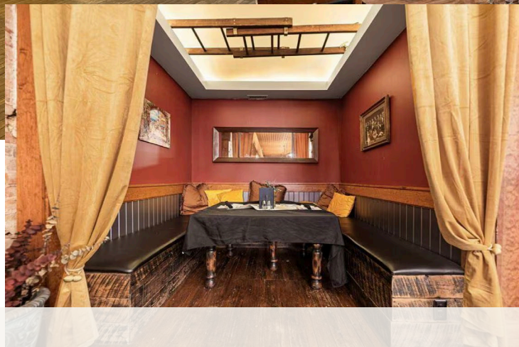
The Dining Room • 5,775 SF across three zones • Original hardwood floors & pressed tin ceilings • Bar in place