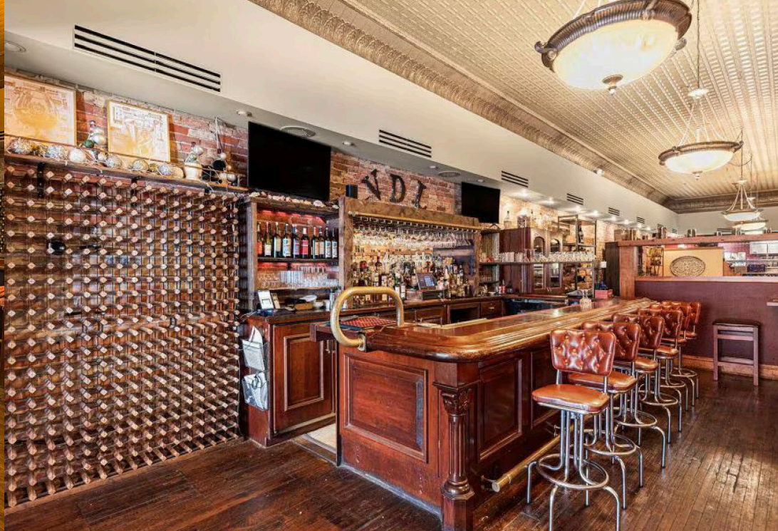
The Bar & Lounge Entry • Existing bar millwork in place • Piano lounge area