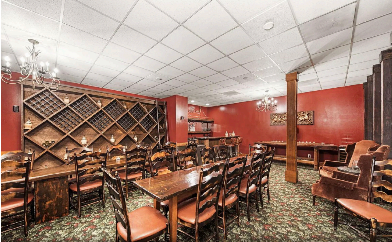
Private Dining Room • ~1,300 SF