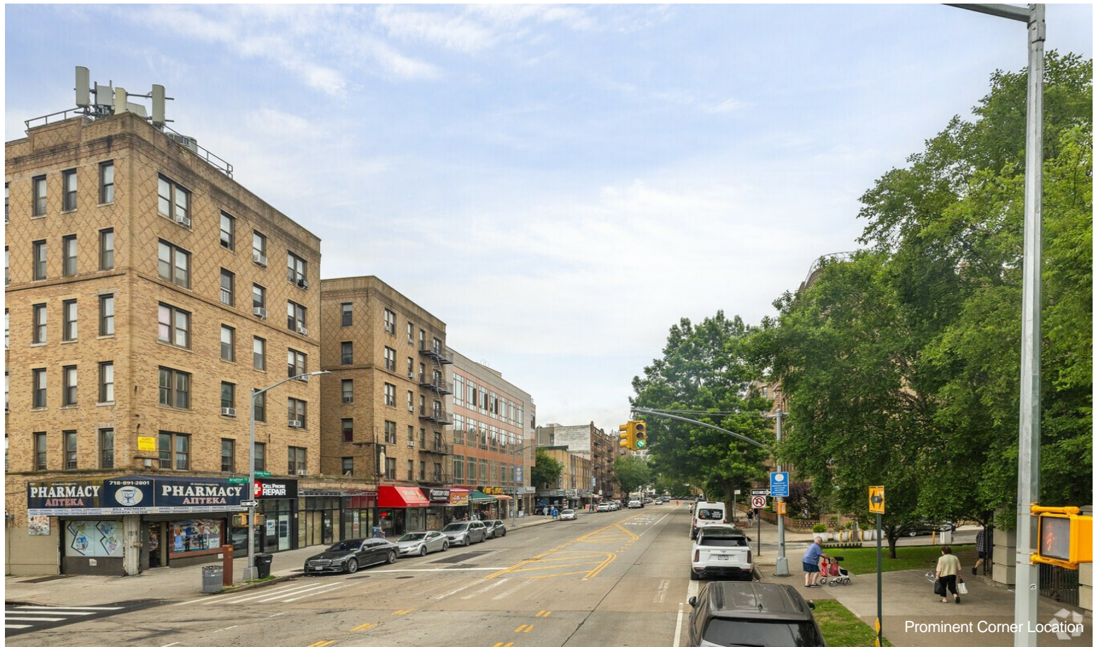
Prominent Corner Location