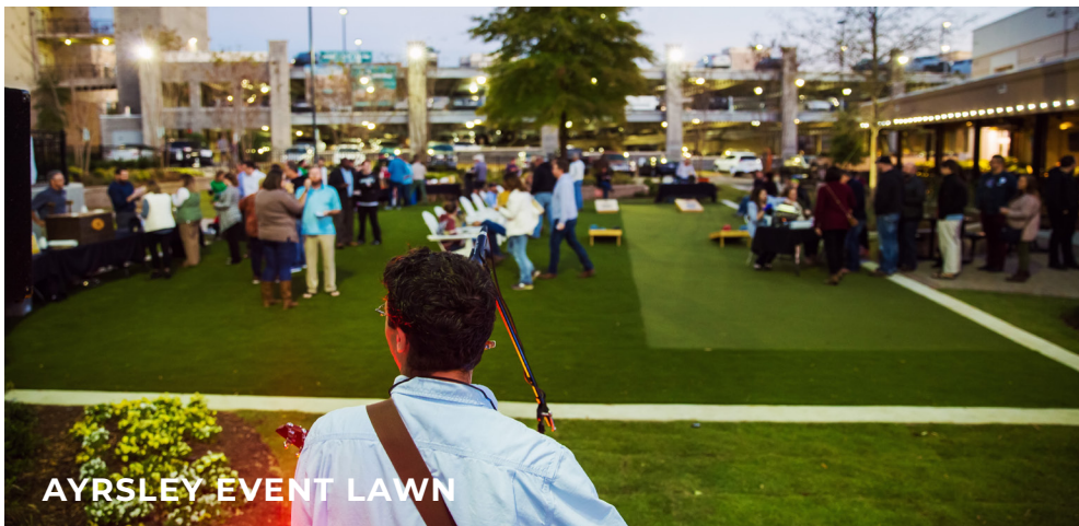
AYRSLEY EVENT LAWN