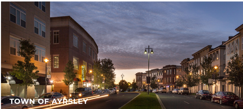
TOWN OF AYRSLEY