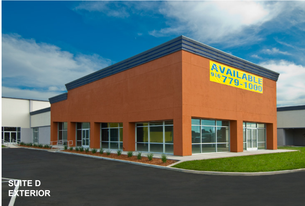
SUITE D EXTERIOR