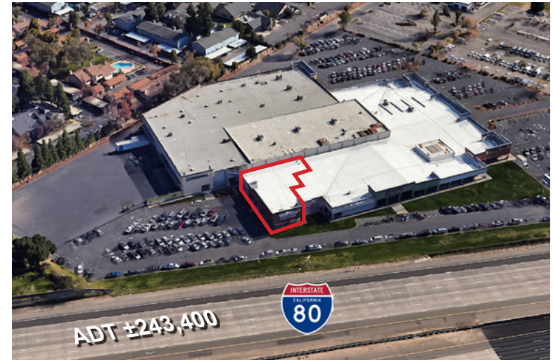
Visibility from I-80