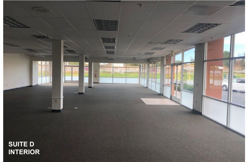
SUITE D INTERIOR