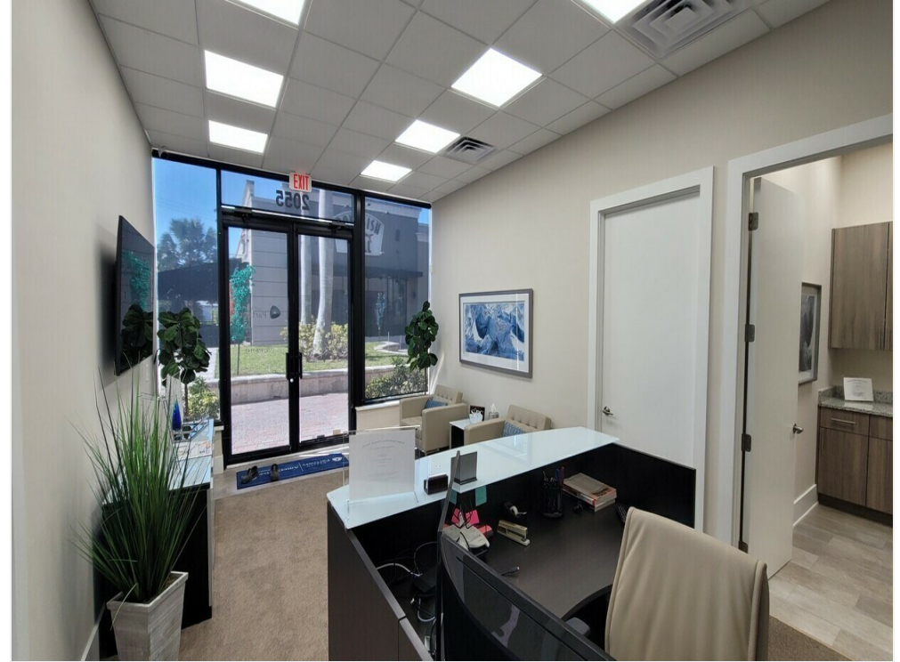
OFFICE SPACE AVAILABLE NOW!