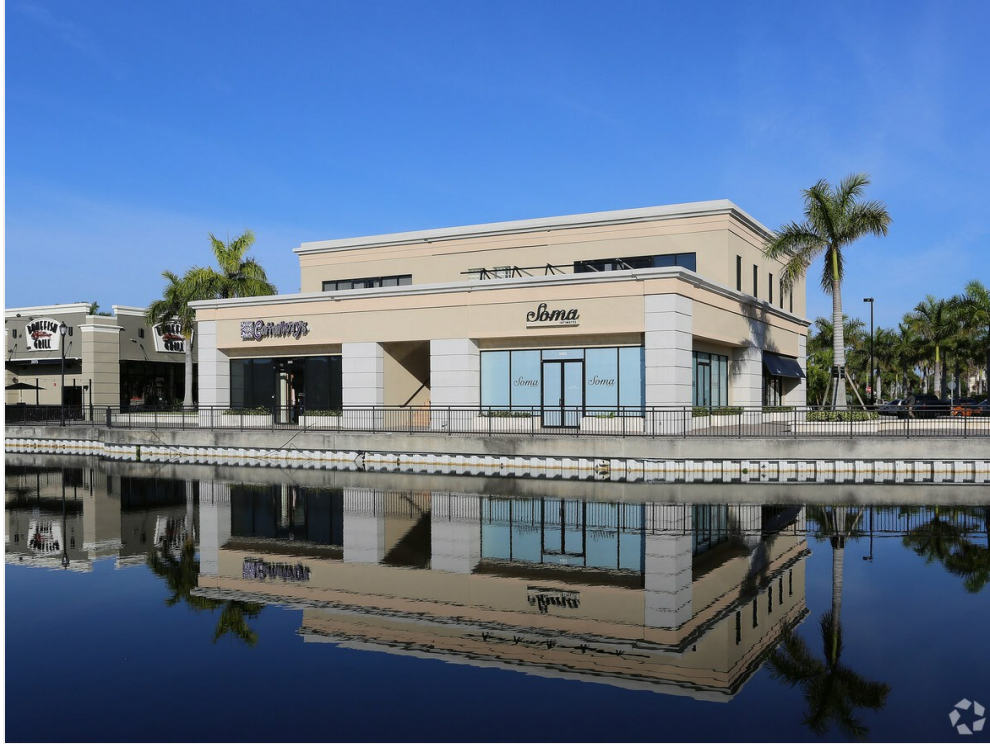
2053-2063 Indian River Blvd - Bldg C