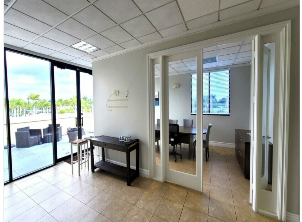
OFFICE SPACE AVAILABLE NOW!