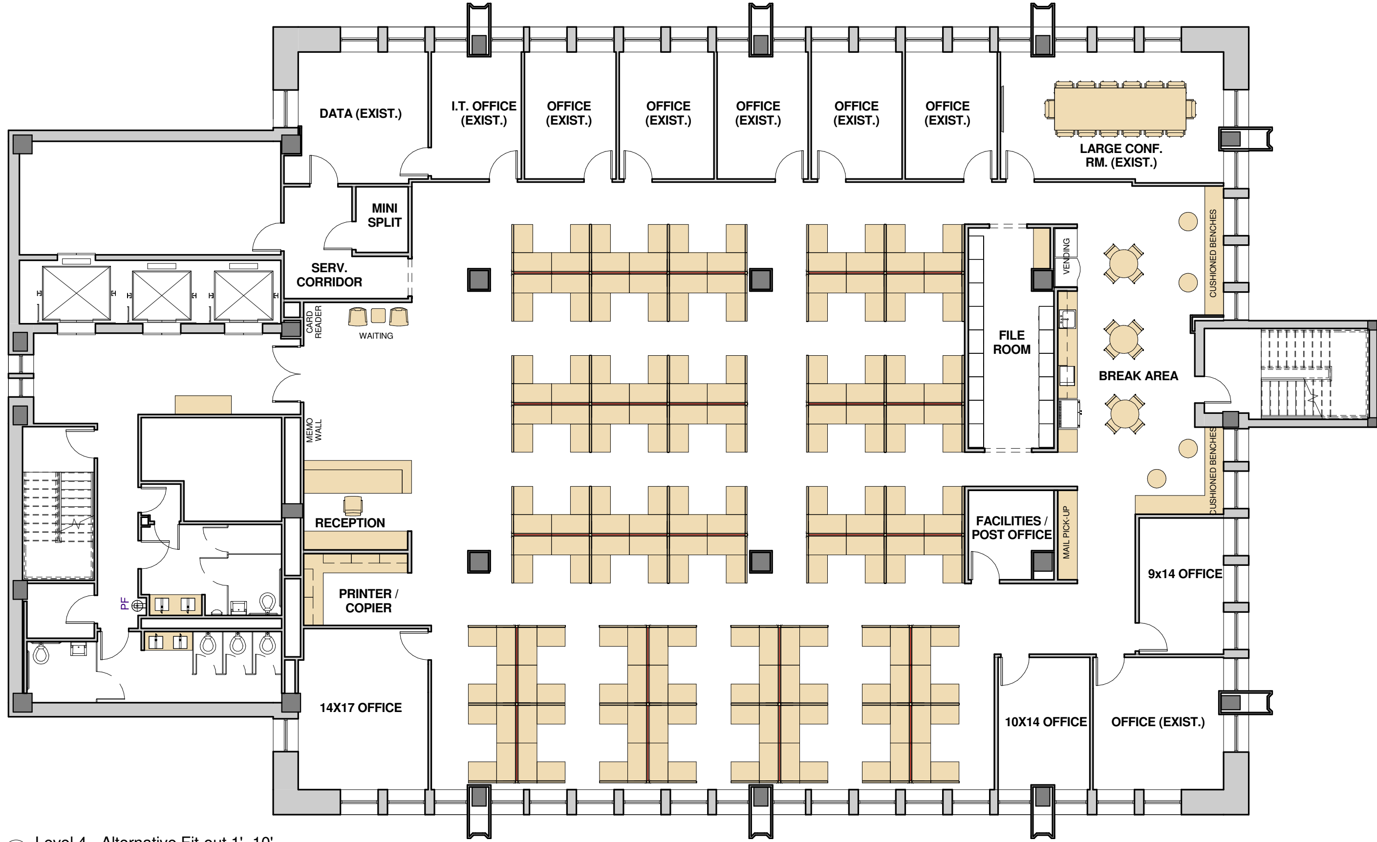
1 Level 4 - Alternative Fit-out 1"=10' 1" = 10'-0"