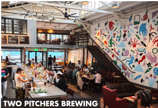
TWO PITCHERS BREWING