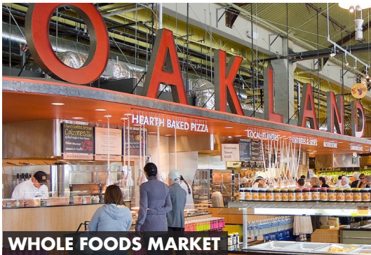
WHOLE FOODS MARKET