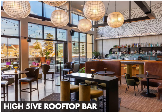
HIGH FIVE ROOFTOP BAR