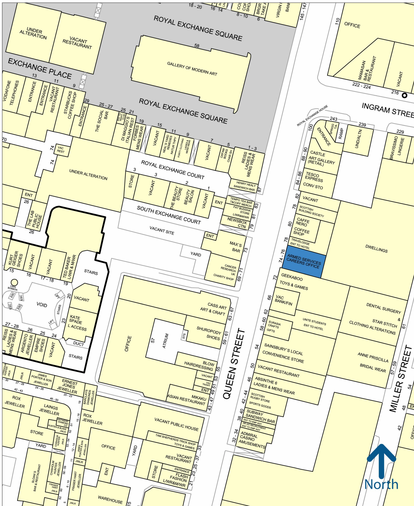
Experian Goad Plan Created: 23/02/2022 Created By: Ryden LLP