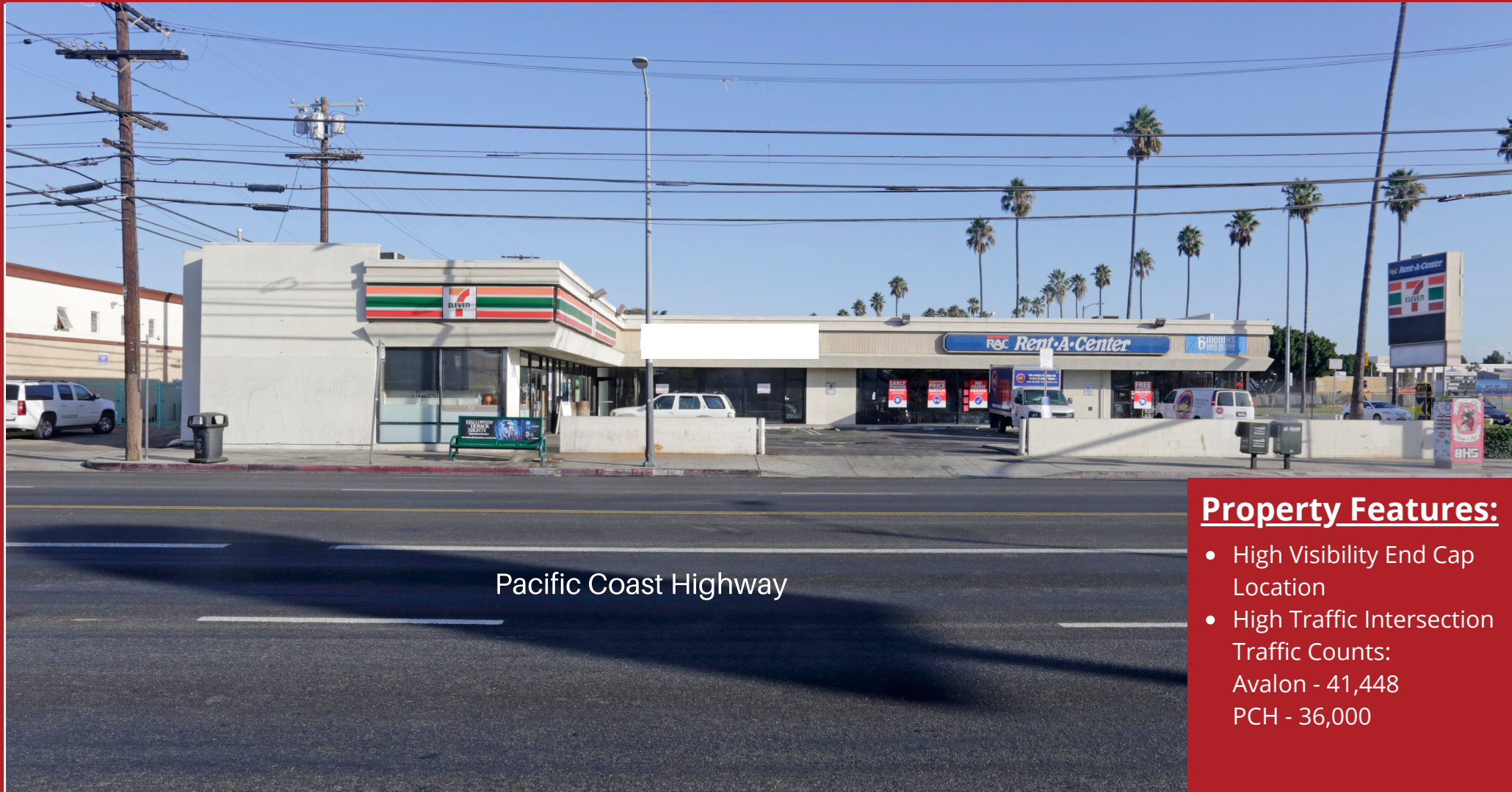
Pacific Coast Highway

111 W Pacific Coast Highway Wilmington, CA 90744