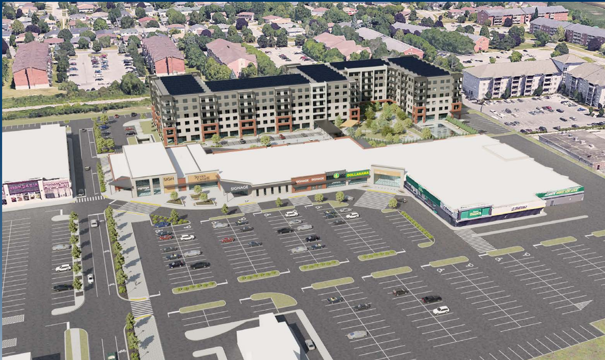
FRONTENAC CENTRE I RESIDENTIAL DEVELOPMENT + MALL REVITALIZATION Phase one site overview