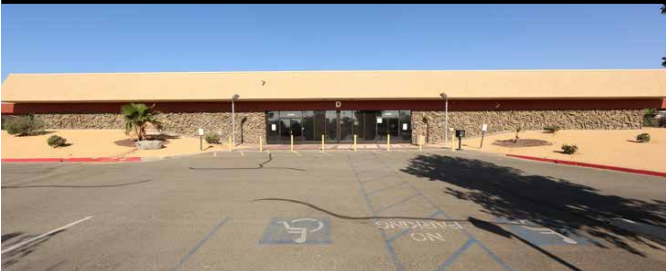
16071 Mojave Dr Office 2