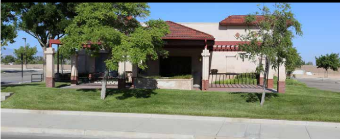
15168 La Paz Rd Office 3