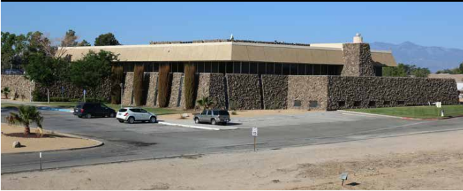
15055 La Paz Rd Retail

16071 Mojave Dr, 15055 & 15168 La Paz Dr, Victorville, CA