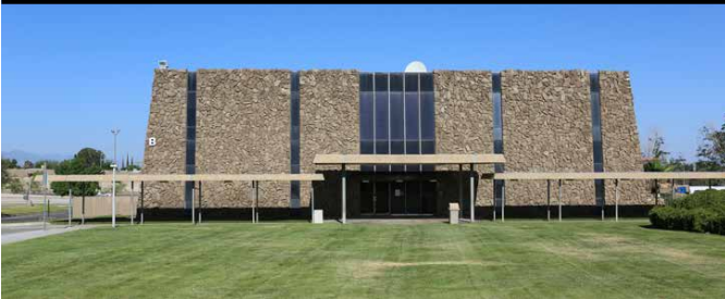
16071 Mojave Dr Office 1

*Which allows for local retail business and commercial needs including stores, shops and office supplying commodities or performing services for the residents of the surrounding community.