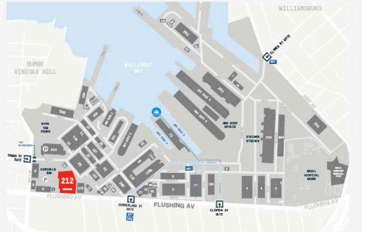
BLDG 212 LOCATION