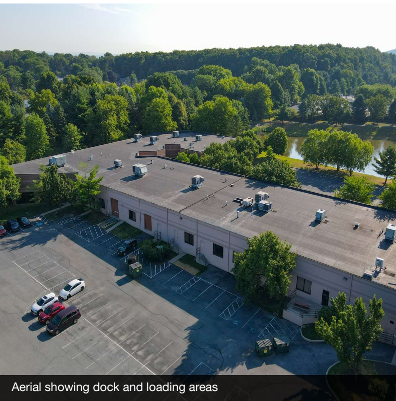
Aerial showing dock and loading areas