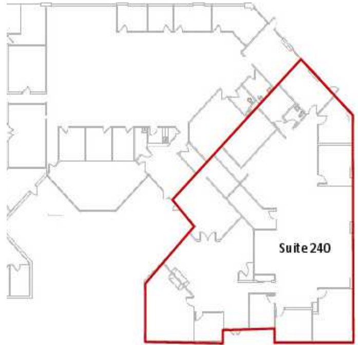
Floor Plan Suite 240 - Office Suite