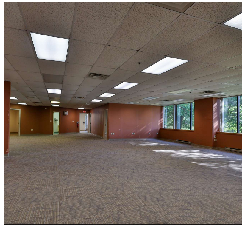
Suite 240 - Interior Photo

The information contained herein has been obtained from sources believed to be reliable; however, NAI Summit makes no representations, warranties, or guarantees, express or implied, as to the accuracy or completeness of this information. All information is subject to errors, omissions, changes in price, rental, or other conditions, prior sale, lease, or financing, or withdrawal without notice. Any reliance on this information is at your own risk, and you are advised to conduct your own independent review and due diligence. NAI Summit and its logo are service marks of Summit Management and Realty Company d/b/a NAI Summit. All other service marks, trademarks, logos, and images are the property of their respective owners and are used herein for informational purposes only. Unauthorized use of images or materials without written permission is strictly prohibited. All rights reserved.