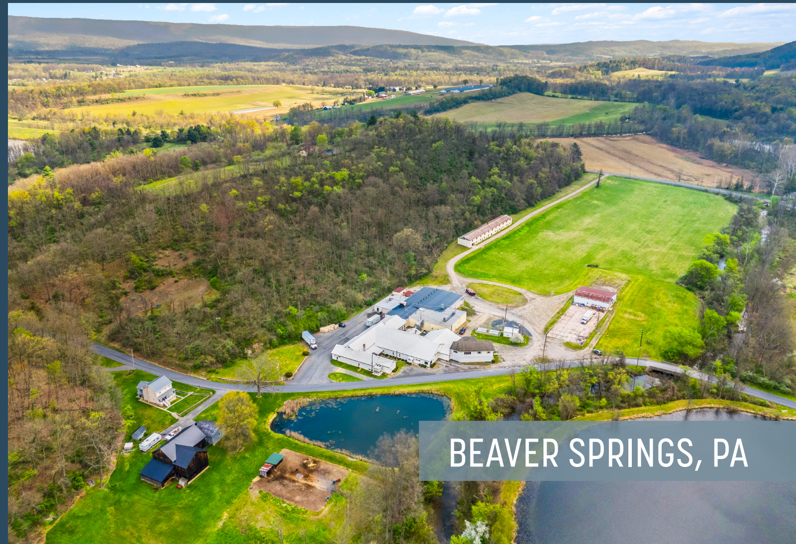
BEAVER SPRINGS, PA