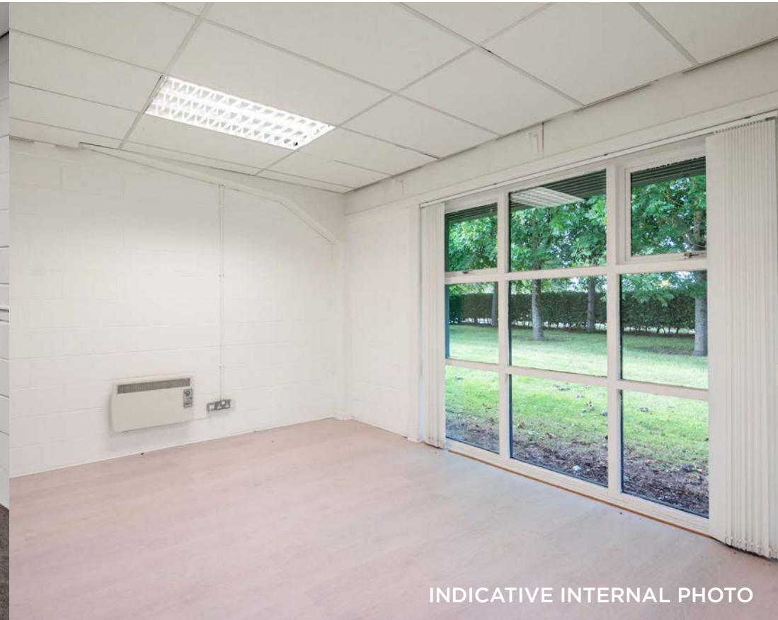
INDICATIVE INTERNAL PHOTO