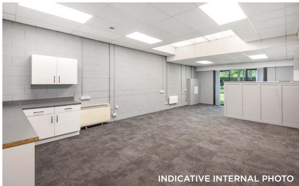
INDICATIVE INTERNAL PHOTO

Each unit at Bilston Enterprise Centre potentially qualifies from 100% relief from business rates payable under the current Small Business Rates Relief Scheme, subject to occupier's circumstances.