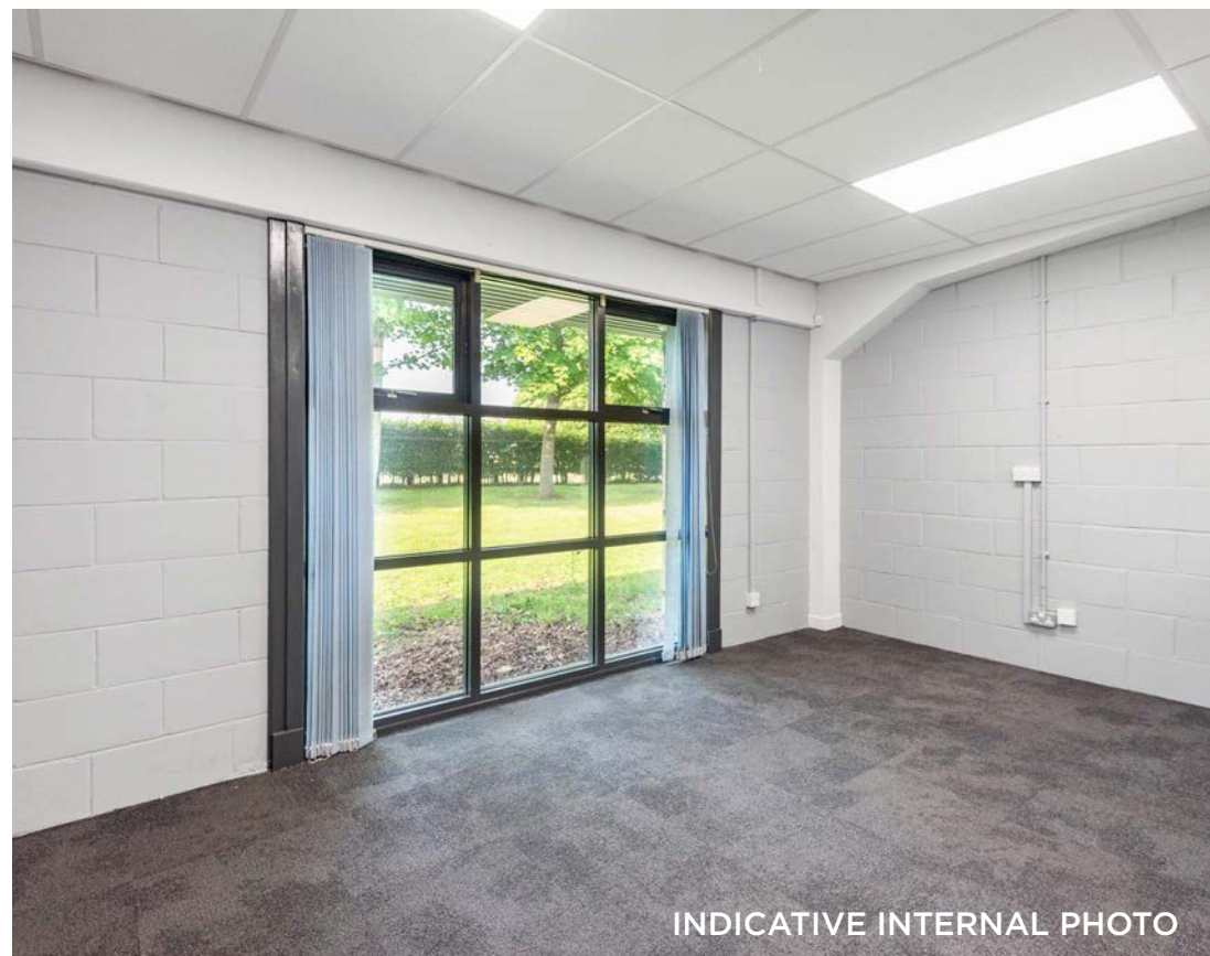
INDICATIVE INTERNAL PHOTO