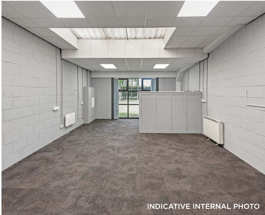
INDICATIVE INTERNAL PHOTO