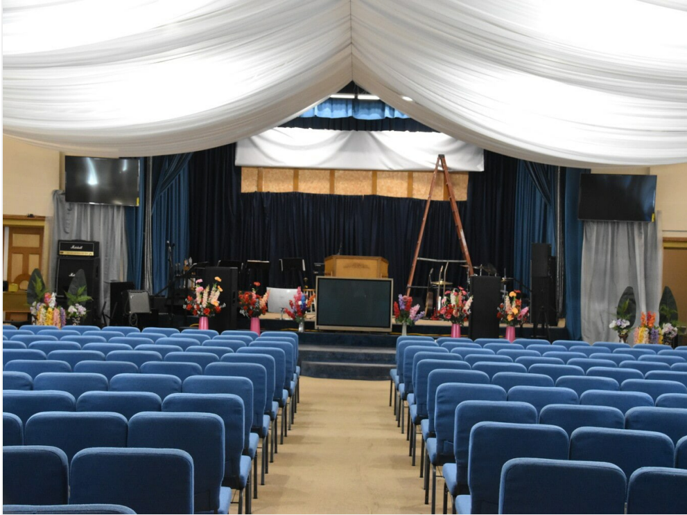
Sanctuary from Rear