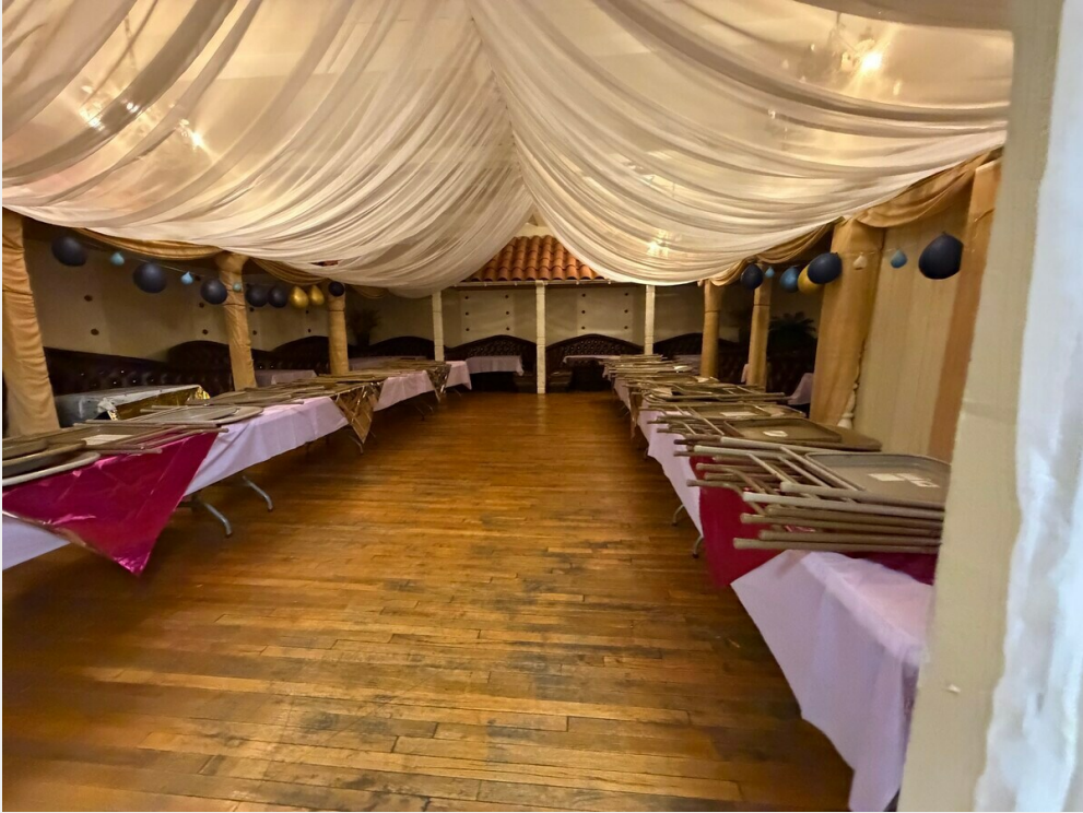
Banquet Hall Seating Area 4