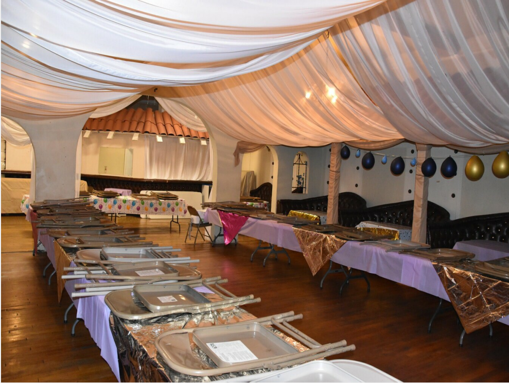
Banquet Hall Seating Area 3