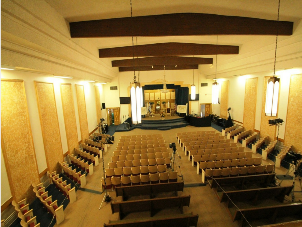
Archived Photo of Sanctuary from Balcony