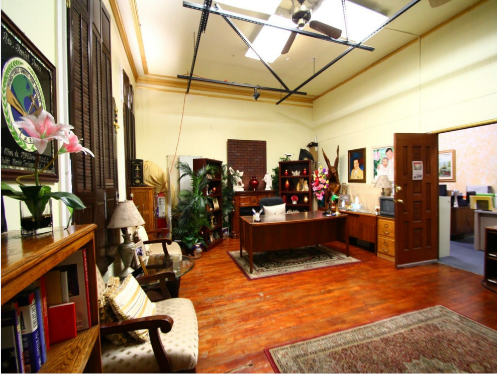
Archived Photo of 1st Floor Office