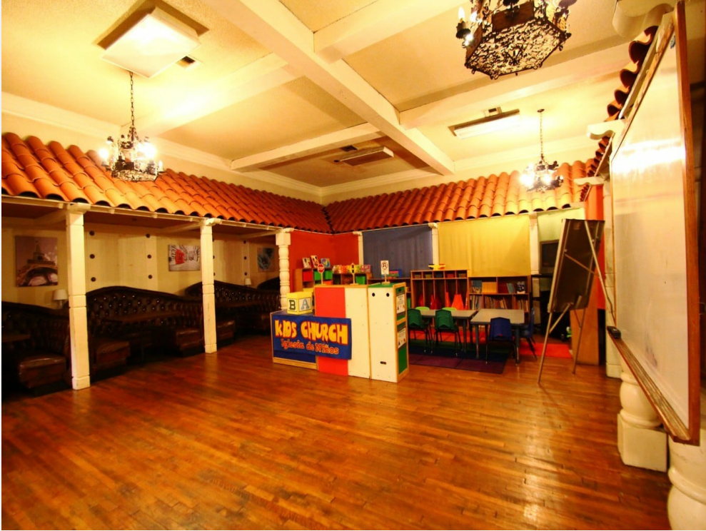
Archived Photo of Dining Area