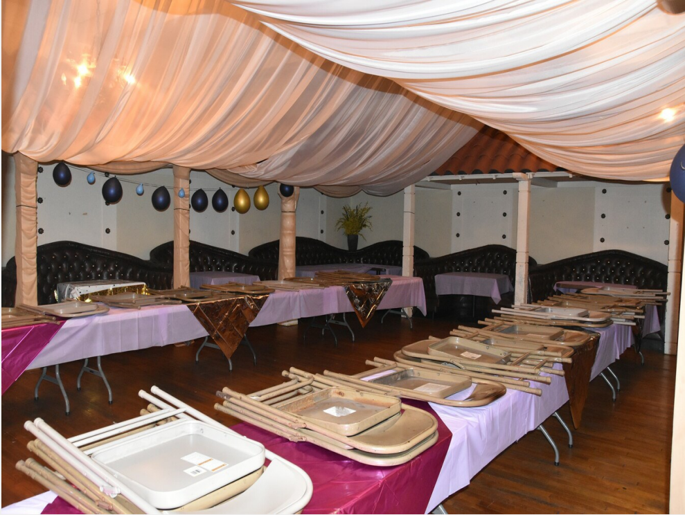
Banquet Hall Seating Area