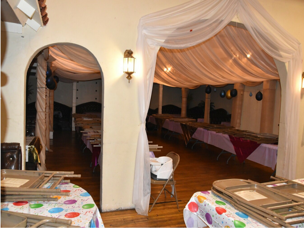
Banquet Hall Seating Area 2