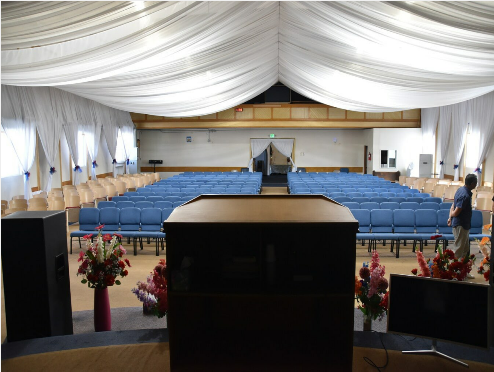
View from Pulpit