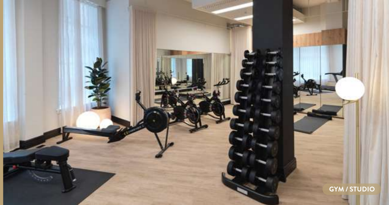
GYM / STUDIO