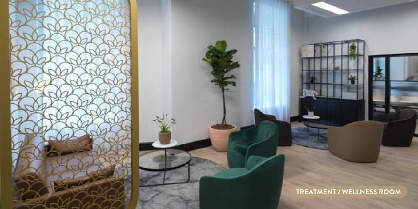
TREATMENT / WELLNESS ROOM