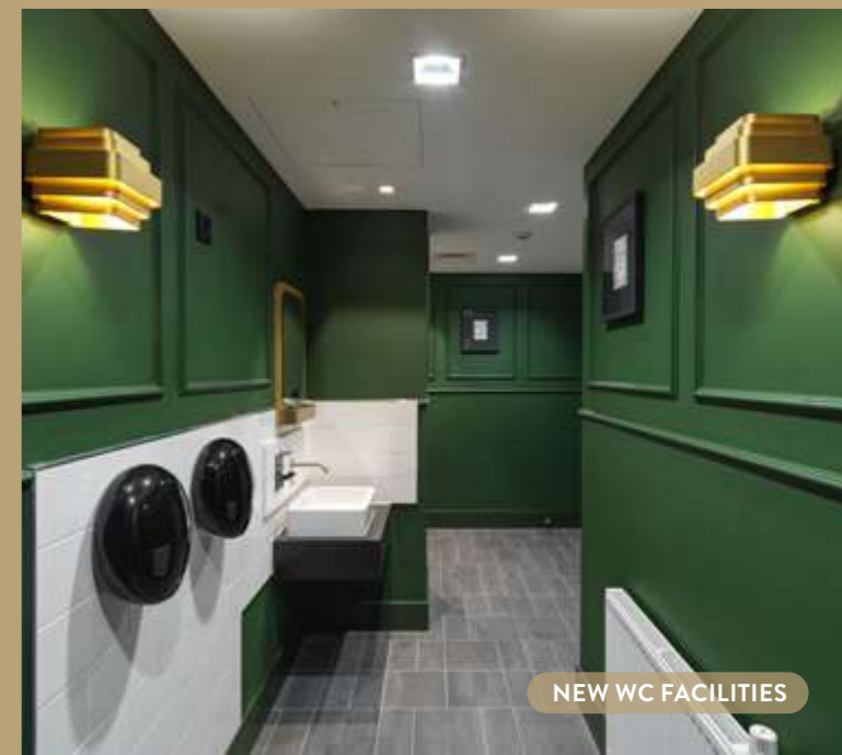
NEW WC FACILITIES