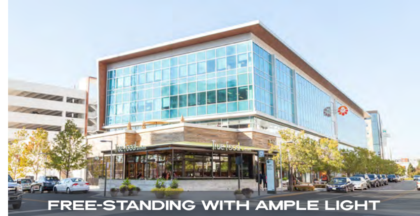
FREE-STANDING WITH AMPLE LIGHT

This unique space is the perfect opportunity to become a part of this diverse community.