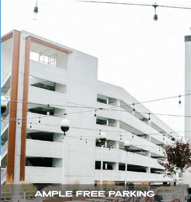
AMPLE FREE PARKING