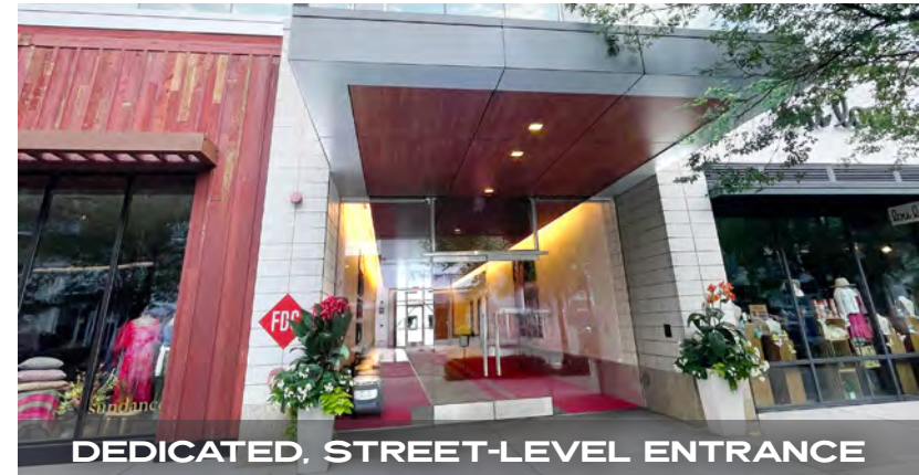
DEDICATED, STREET-LEVEL ENTRANCE