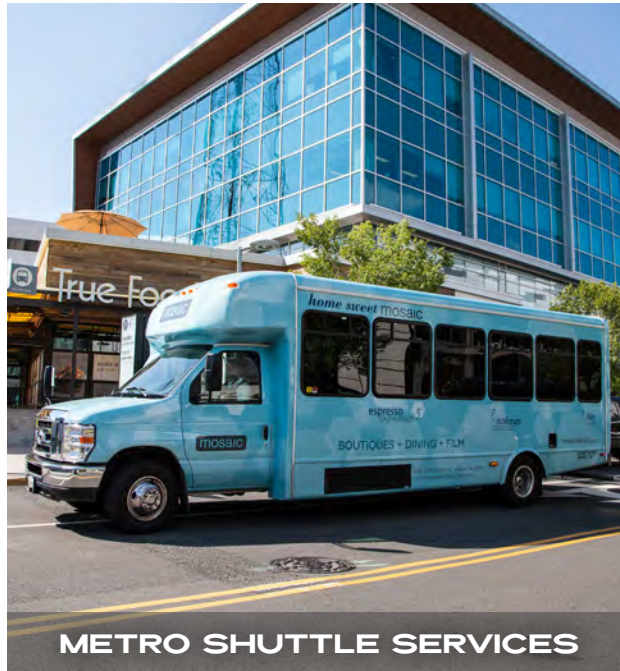
METRO SHUTTLE SERVICES