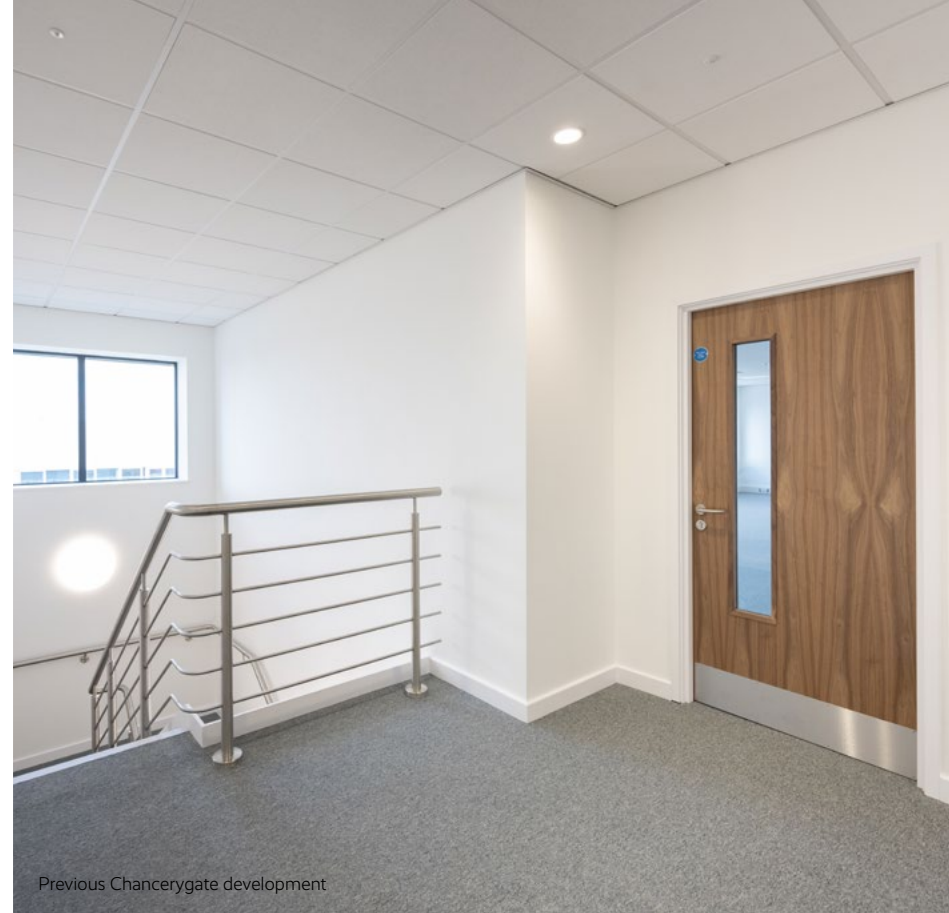
Previous Chancerygate development