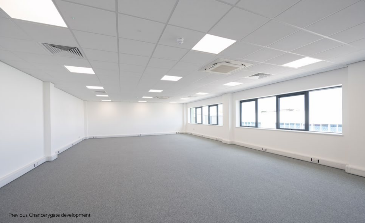
Previous Chancerygate development