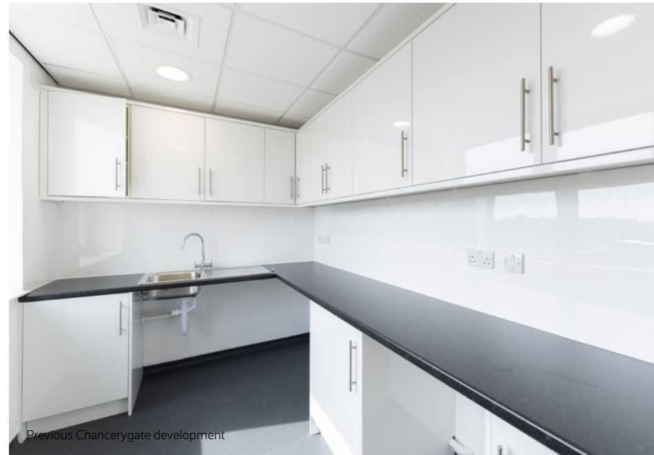
Previous Chancerygate development