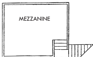
NOT TO SCALE. NOT AS BUILT.