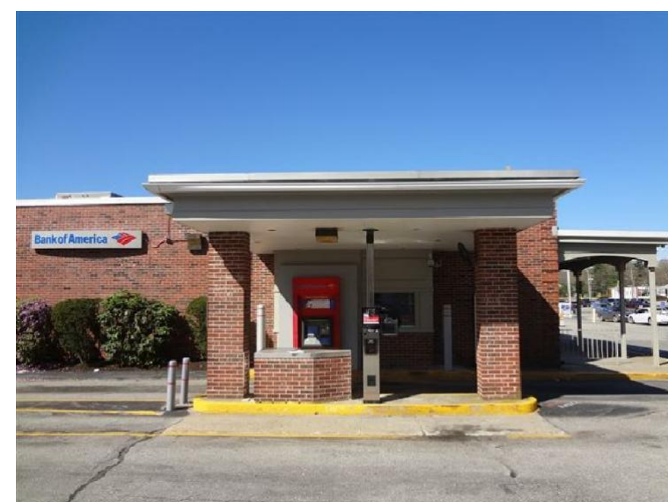
A EXISTING DRIVE THRU SIDE