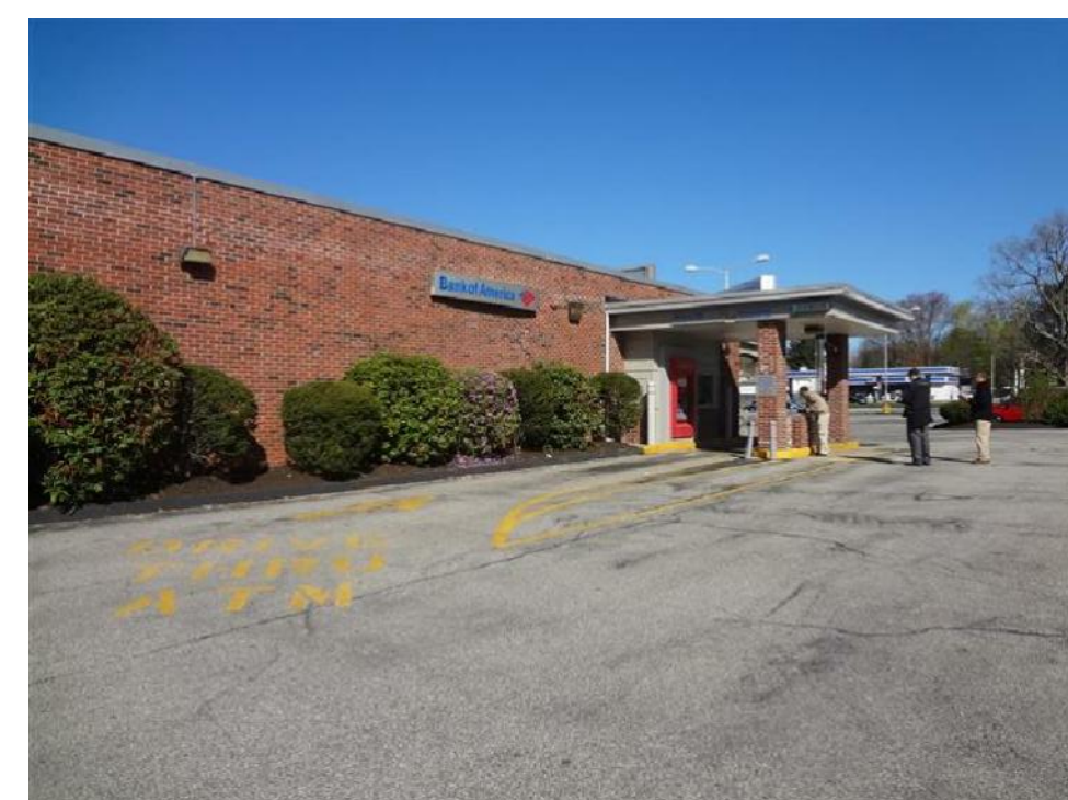
A EXISTING DRIVE THRU APPROACH