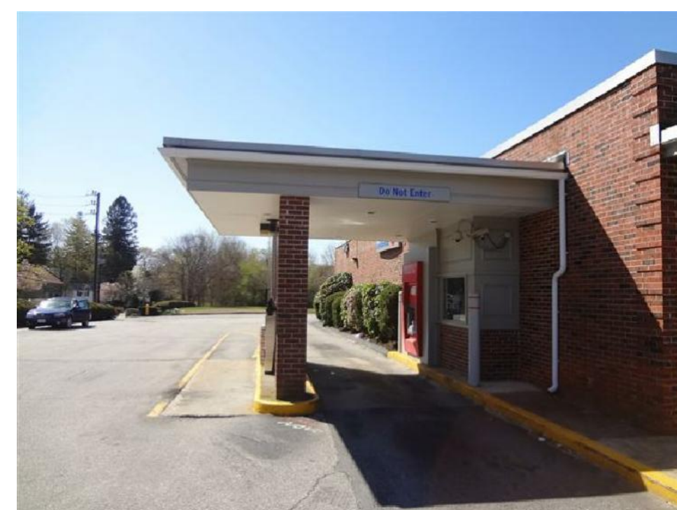
A EXISTING DRIVE THRU EXIT