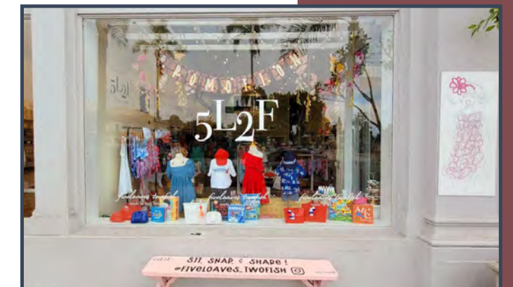
LA MER BOUTIQUE