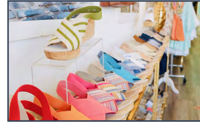
CHARLESTON SHOE COMPANY