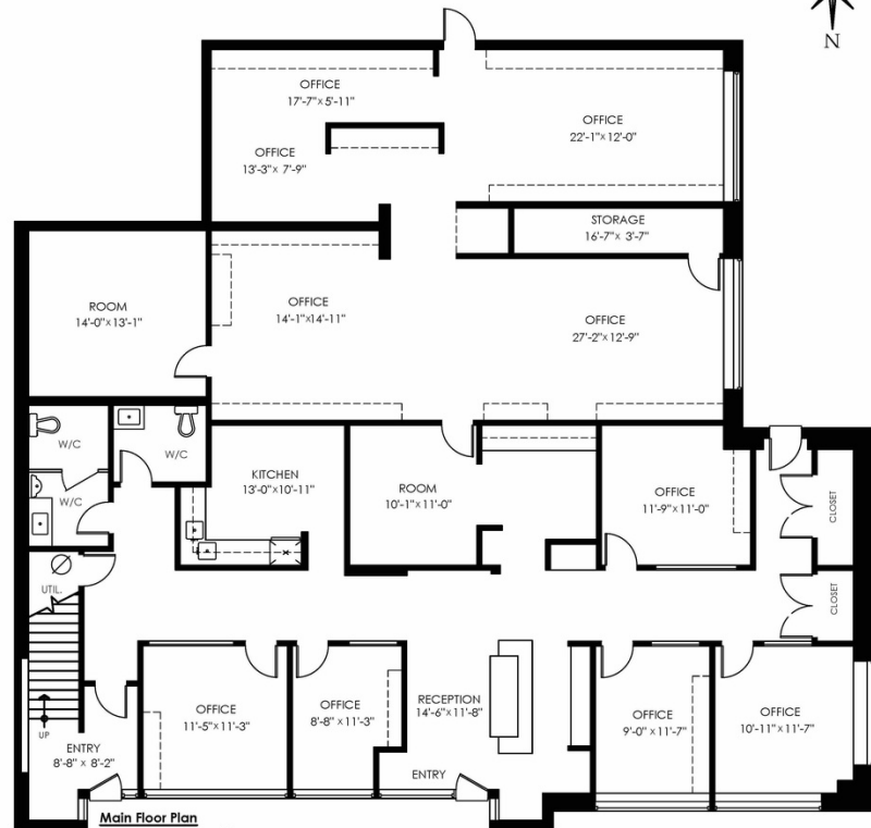
Main Floor Plan Floor Area: 3573 sq.ft. Ceiling Height: 8'-6"

ALL INFORMATION PROVIDED IS THE RESPONSIBILITY OF THE TENANT TO VERIFY IF DEEMED IMPORTANT.