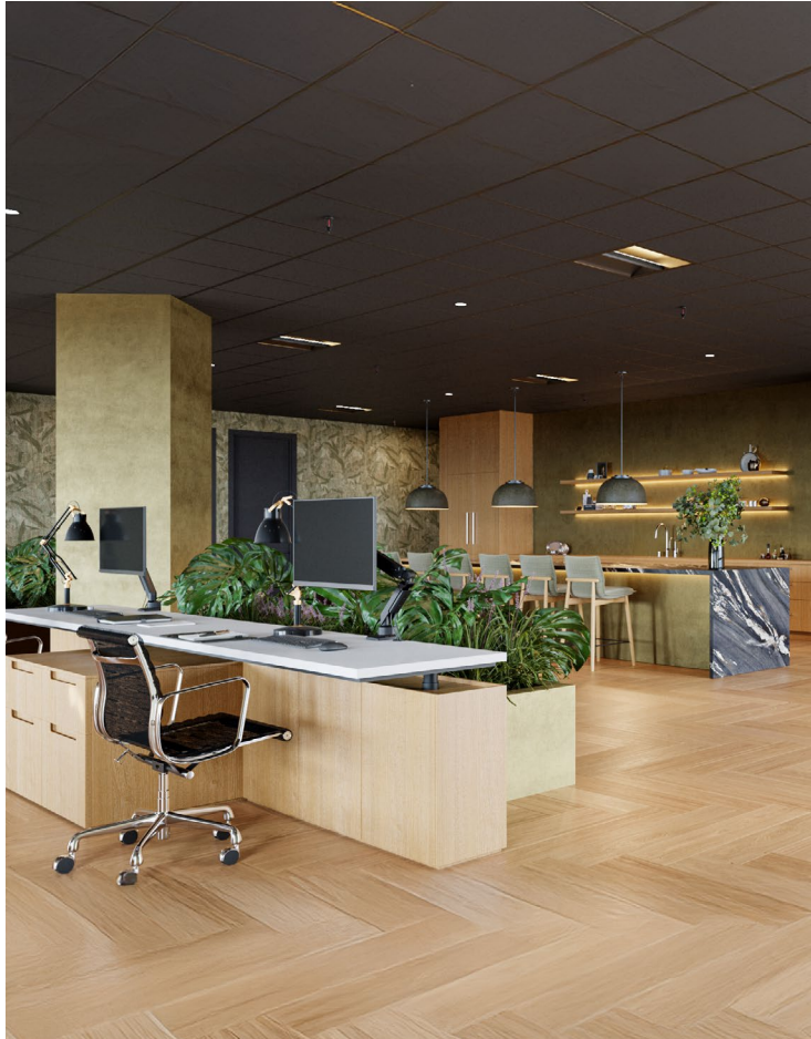
*Photos display hypothetical buildout