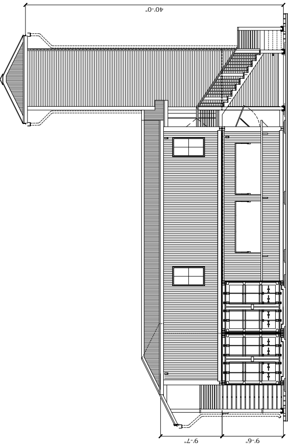
ELEVATION 1 1/4" = 1'-0"