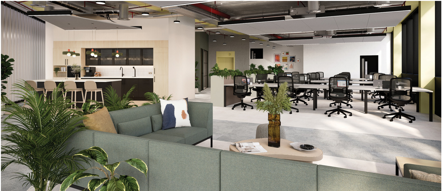
Ground Floor Fitted Office Space CGI