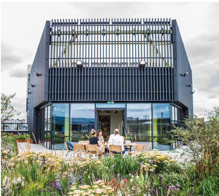
Roof Terrace & Clubroom