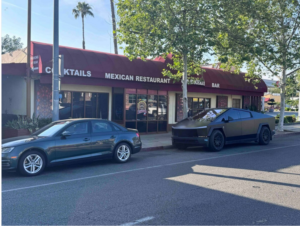
Lake Avenue Frontage