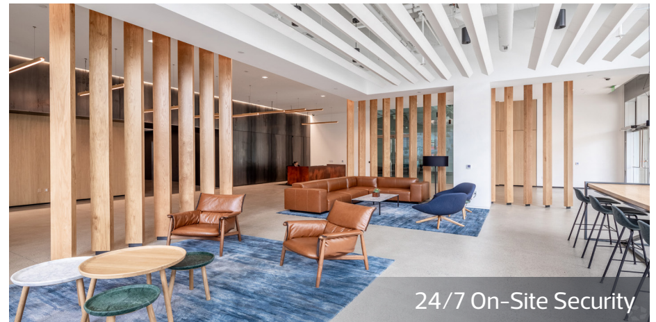
24/7 On-Site Security