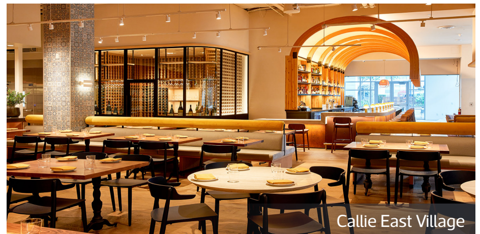
Callie East Village