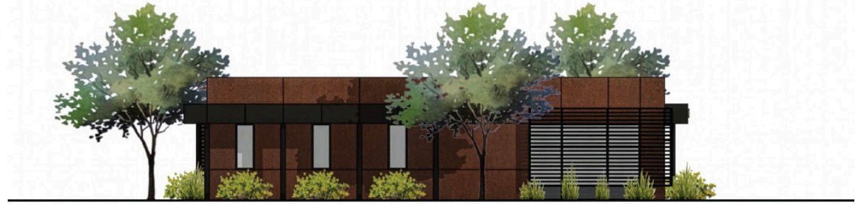
① WEST ELEVATION