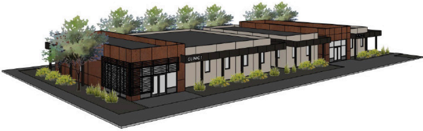
CLINICS 3D VIEW