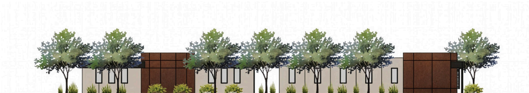
④ NORTH ELEVATION