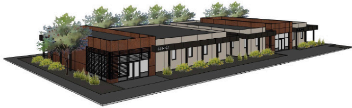
CLINICS 3D VIEW