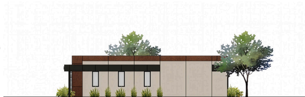
③ WEST ELEVATION