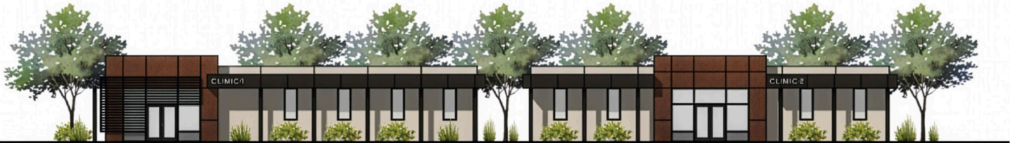
② SOUTH ELEVATION