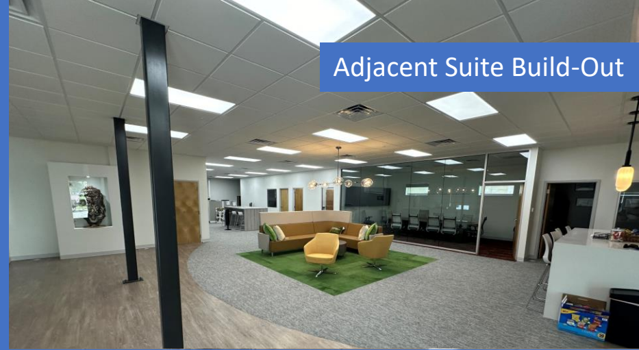
Adjacent Suite Build-Out