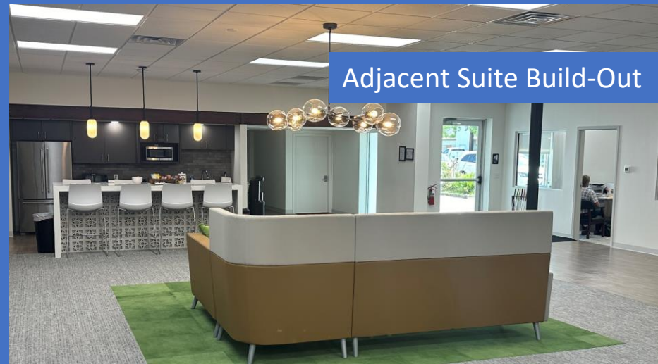
Adjacent Suite Build-Out