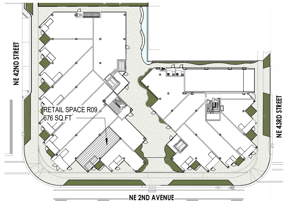
1 KEY PLAN SCALE: 1" = 50'-0"

THE INFORMATION PROVIDED ON THE LOD IS BASED ON INFORMATION FOUND IN THE BASE BUILDING (VENDOR PACKAGE) CORRESPONDENCE OR WORKING DRAWINGS AND MAY NOT REFLECT FINAL "ON-SITE AS IS" CONDITION NOR ALL CONDITIONS THAT MAY RESULT FROM ON SITE ADJUSTMENTS DURING CONSTRUCTION. THE LOD IS NOT INTENDED TO REFLECT EVERY CONDITION WITHIN THE SPACE WITH RESPECT TO STRUCTURE & MEP ONE OFF CONDITIONS. ADDITIONALLY , SCHEMATIC DESIGN DEVELOPEMENT DRAWINGS ARE SUBJECT TO CHANGE AS THE PROJECT DOCUMENTS ARE FINALIZED. IT IS THE RESPONSABILITY OF THE TENANT'S ARCHITECT AND CONTRACTOR TO FIELD VERIFY ALL INFORMATION PERTAINING TO THE PREMISES PRIOR TO COMMENCEMENT OF TENANT DRAWINGS & CONSTRUCTION.