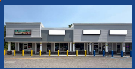
224 PENNYPACKER DRIVE