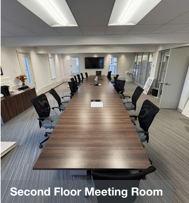
Second Floor Meeting Room