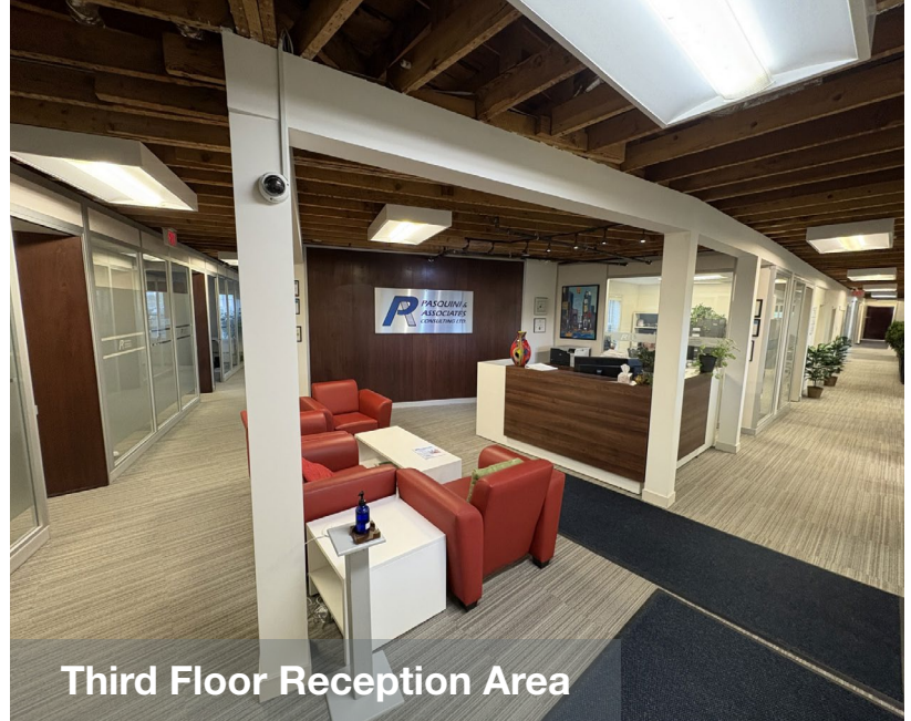
Third Floor Reception Area