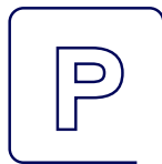
Ample On-site Parking