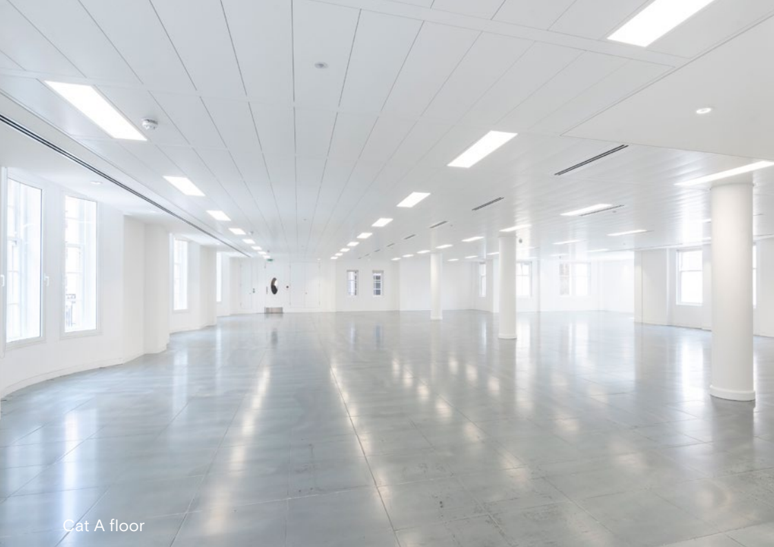
Cat A floor