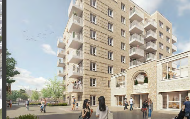
Computer Generated Images of proposed redevelopment of Kilburn Square Housing Estate

A new One Kilburn partnership has been formed to bring businesses, residents and local stakeholders together to develop a vision and action plan for the town centre that will identify projects for securing investment and longer-term regeneration.