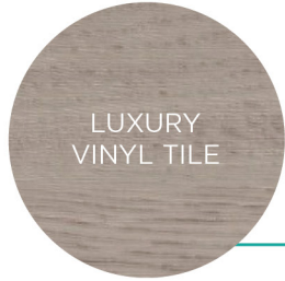
LUXURY VINYL TILE