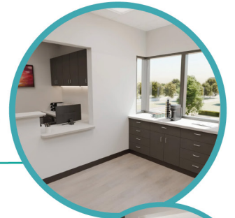
RECEPTION/ WAITING ROOM