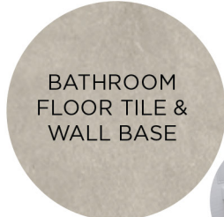
BATHROOM FLOOR TILE & WALL BASE