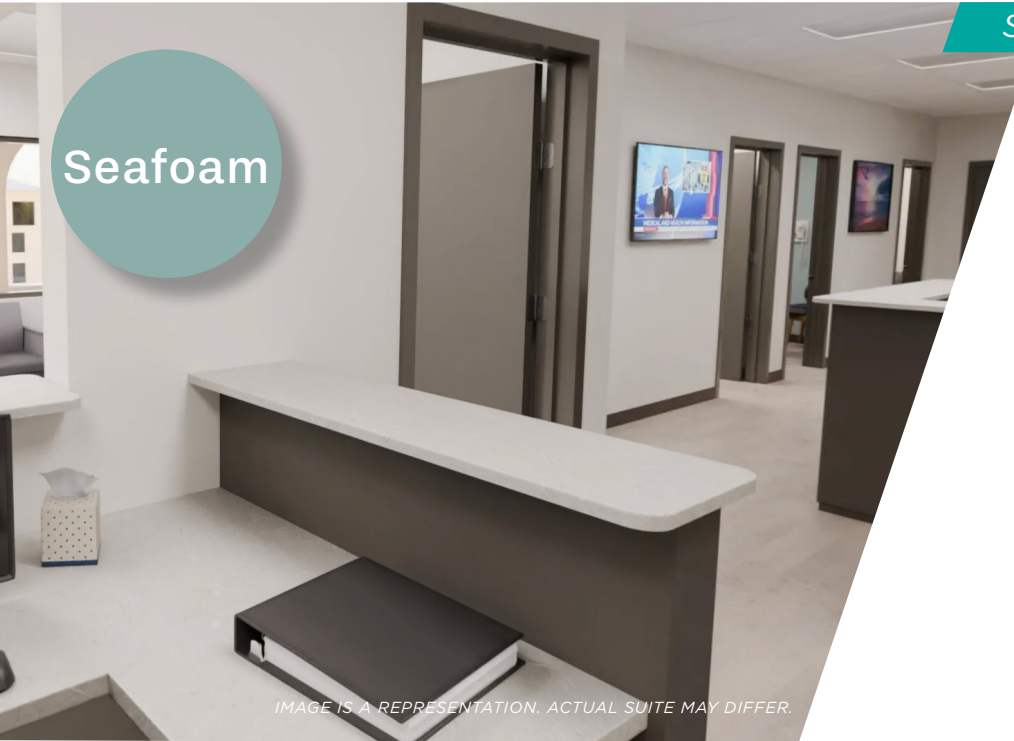
IMAGE IS A REPRESENTATION. ACTUAL SUITE MAY DIFFER.