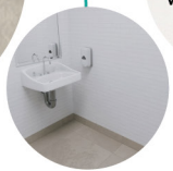
BATHROOM WALL TILE