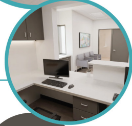
PLASTIC LAMINATE CABINETS