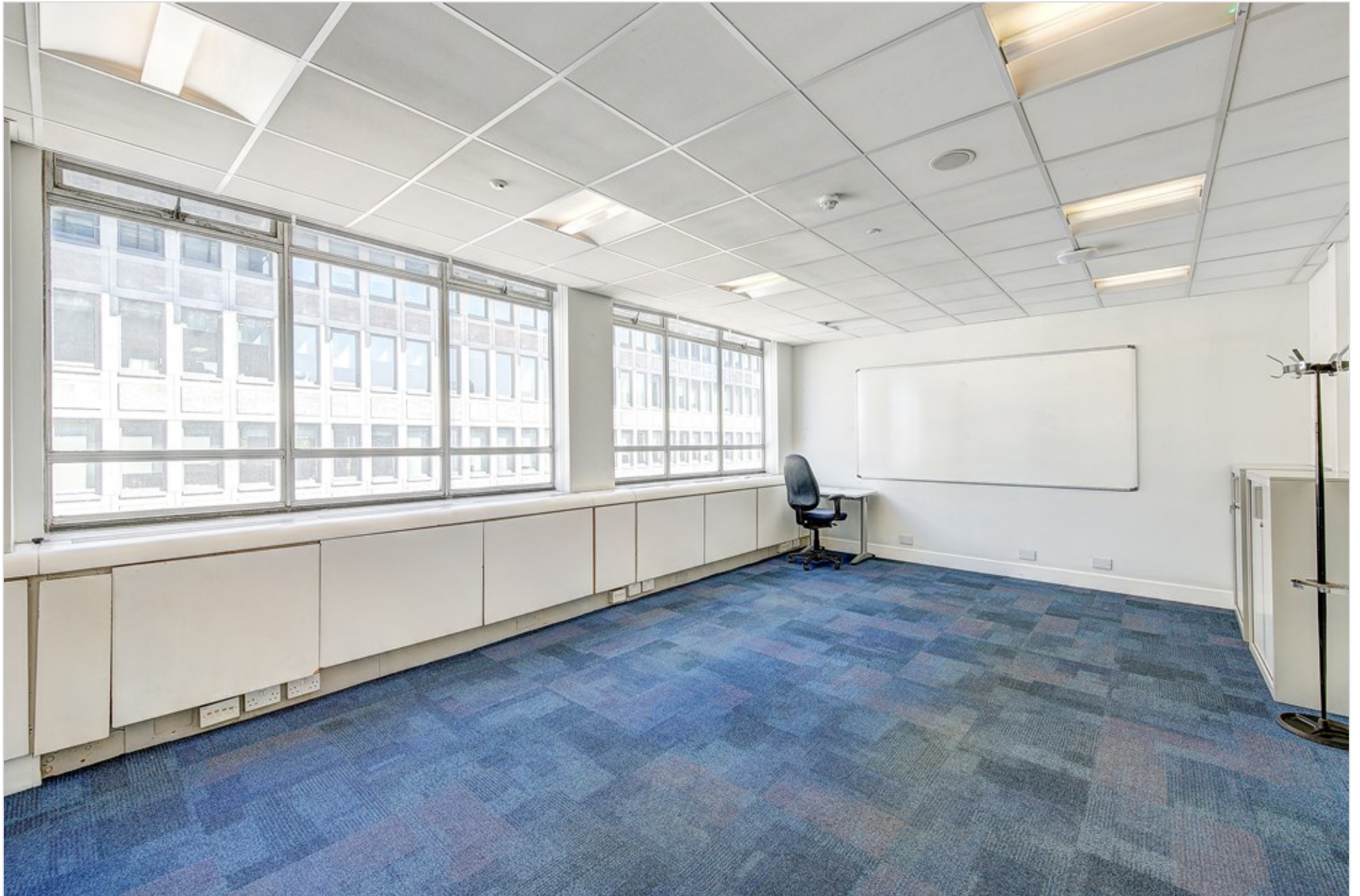
Albany House, 86 Petty France, London, SW1H 9EA