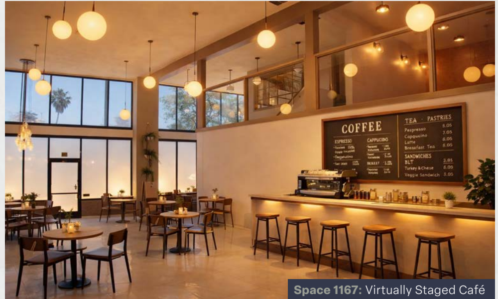
Space 1167: Virtually Staged Café