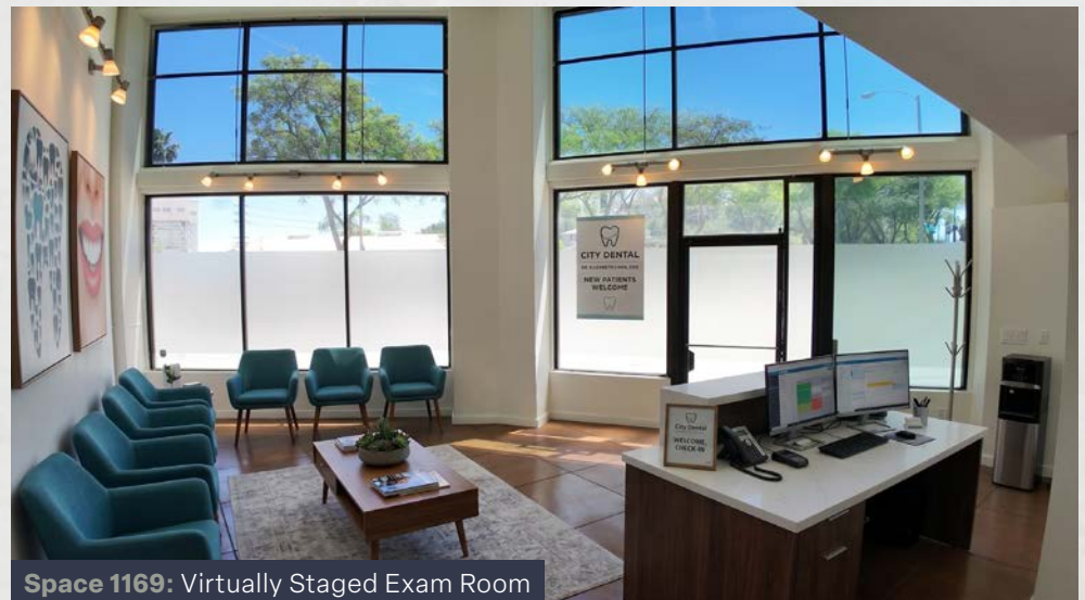
Space 1169: Virtually Staged Exam Room

*Text and images contained in this brochure have been generated in whole or in part by or with the assistance of generative artificial intelligence. All content has been reviewed for accuracy.