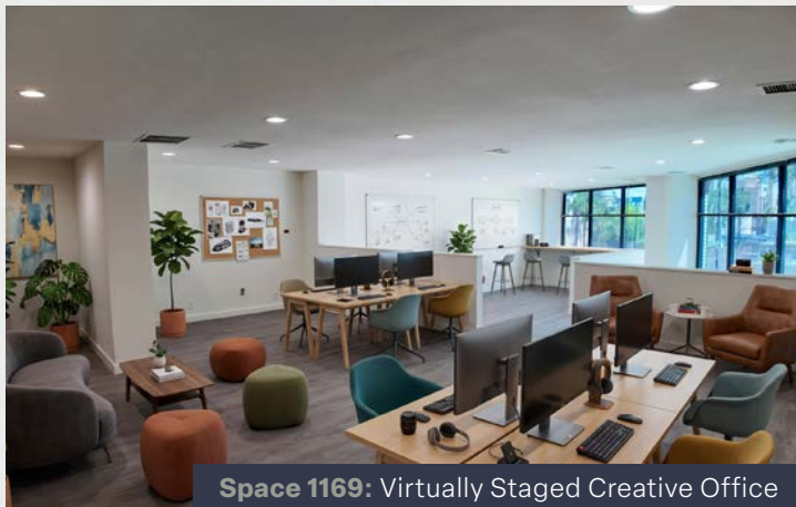
Space 1169: Virtually Staged Creative Office