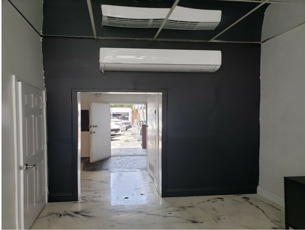
438 N. Fairfax - Entrance From Parking Lot