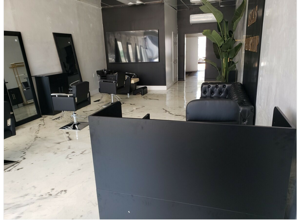
438 N. Fairfax – Interior 4