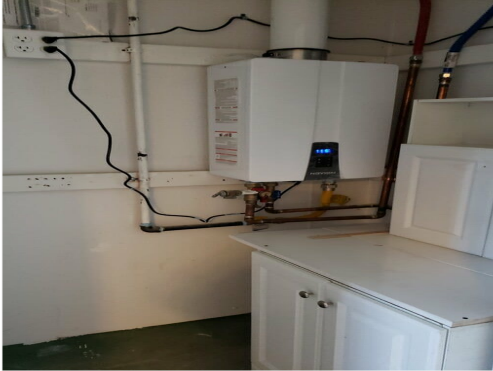
Storage Room - Tankless Water Heater