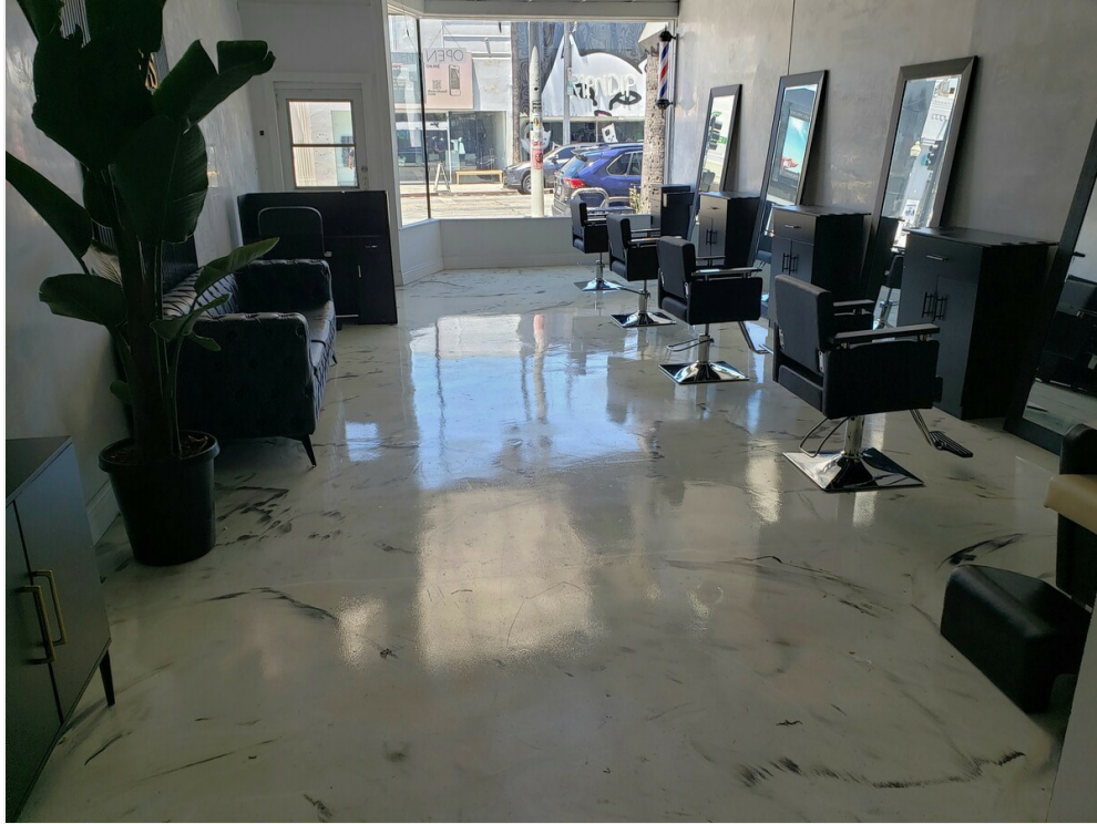
438 N. Fairfax – Interior B