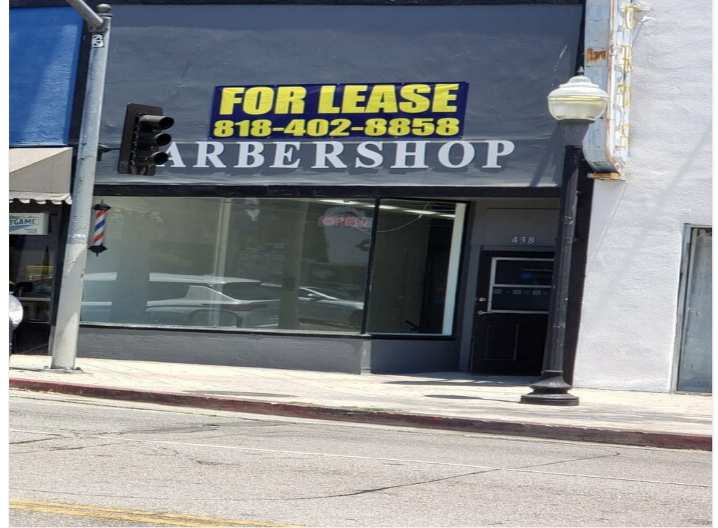
438 N. Fairfax Main