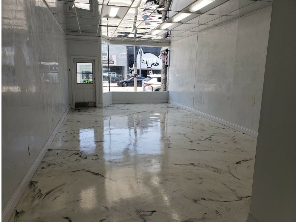
438 N. Fairfax – Interior 1