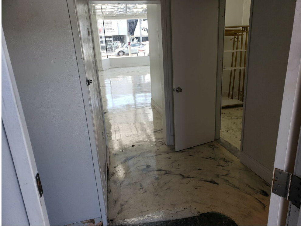
438 N. Fairfax – Interior 2