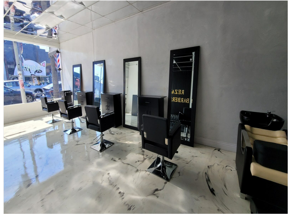
438 N. Fairfax Ave 3