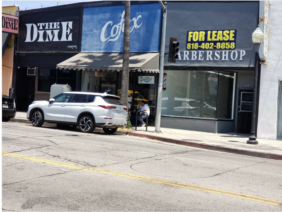
438 N. Fairfax