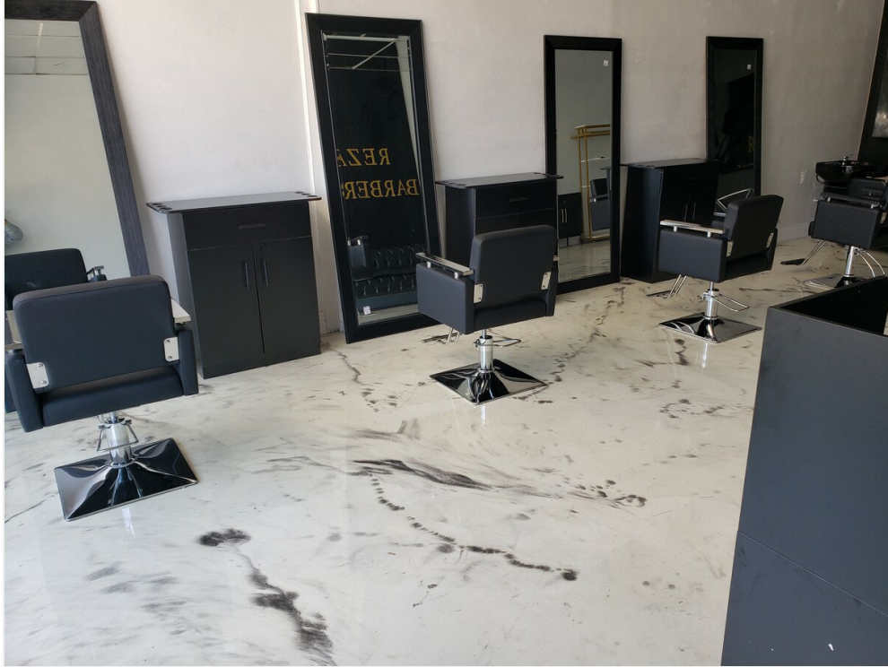
438 N. Fairfax – Interior 5