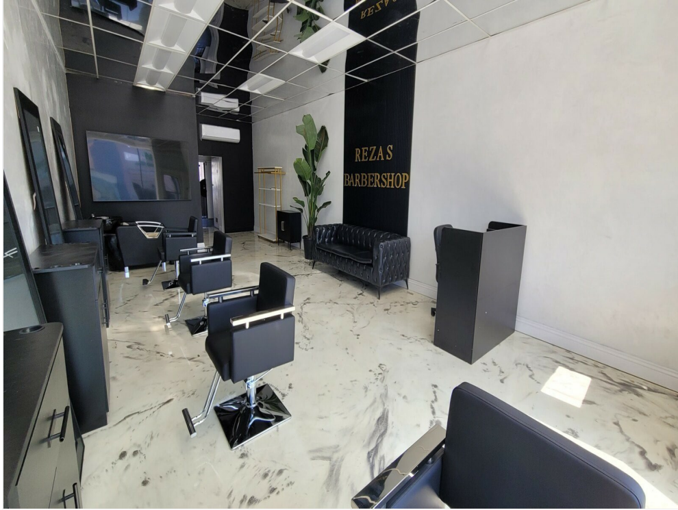
438 N. Fairfax