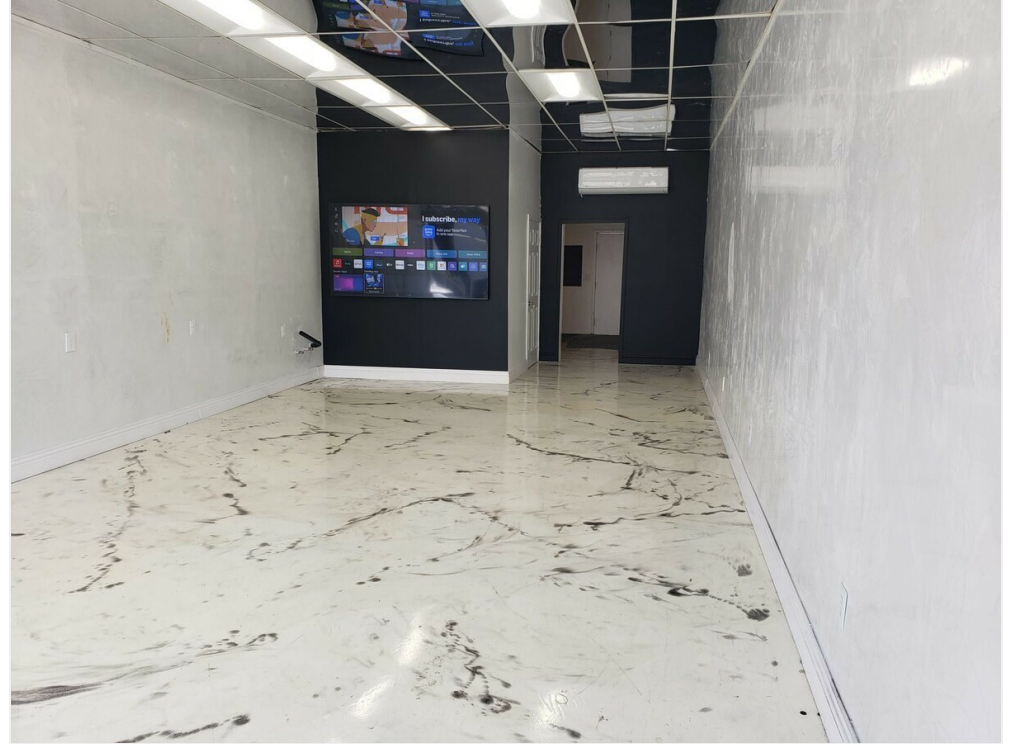
438 N. Fairfax – Interior