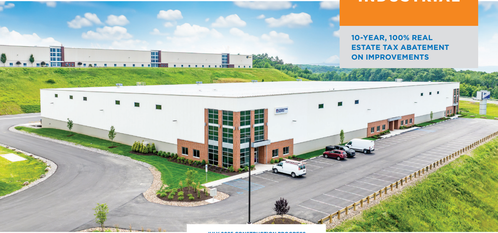
JULY 2025 CONSTRUCTION PROGRESS

10-YEAR, 100% REAL ESTATE TAX ABATEMENT ON IMPROVEMENTS